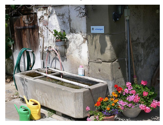
Fig. 2: "Schweigen" ("be silent")

Seven different plaques with walking instructions are fixed on the walls and rocks: