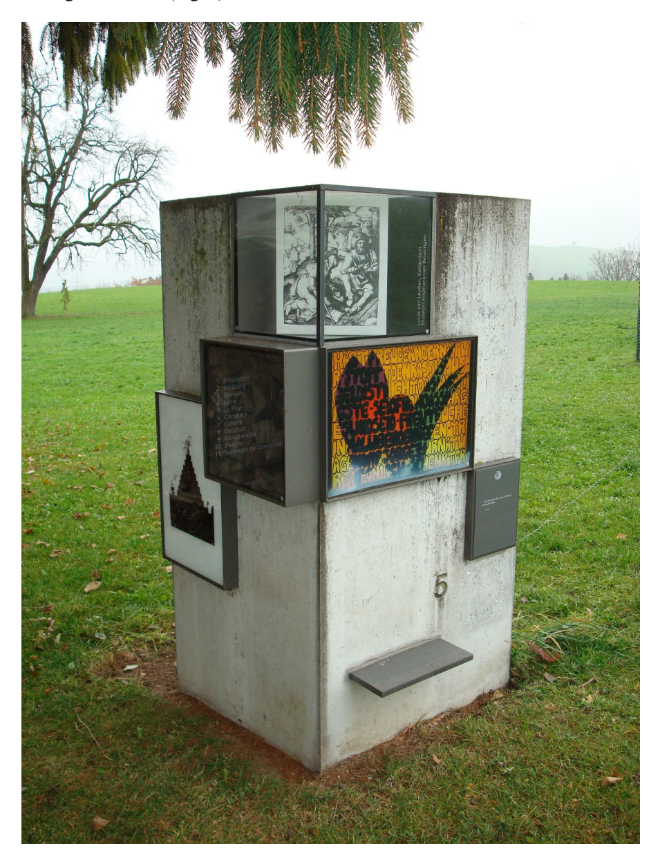
Fig. 4: Pilgrim Station 5 "On the Way of St. James"

Note: There are fourteen large blocks of concrete with images and words attached, engraved, incorporated or otherwise installed into them. There are no titles as such that can reveal the exact meaning of the installations. But as I look at them from all sides, I begin to notice some themes and words that stand out from the children's drawings, collages, caricatures, pictorial messages and scriptures, which might be the clues to the meaning of each block. This is what I discovered: