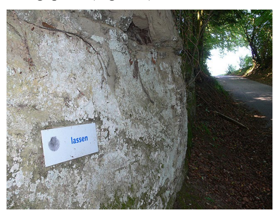
Fig. 1: "Lassen" ("Let go")