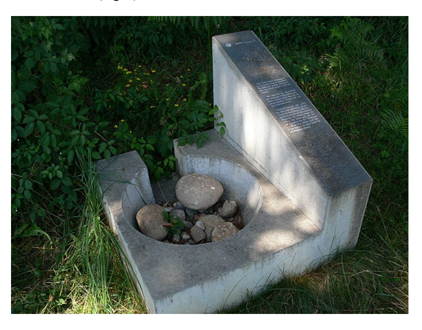
Fig. 3 Stone Altar