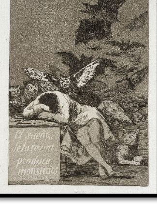
Fig. 4 Goya, The Sleep of Reason Produces Monsters (1799)