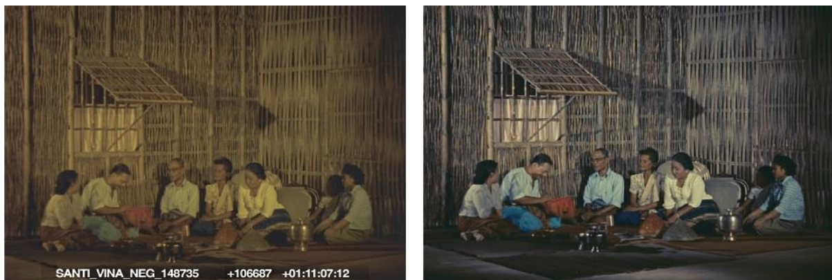
Figure 4: Comparison of the unrestored Santi-Vina (right) and the restored version (left).

The restoration and cleaning took about 1700 hours. It was completed in 2016. This was four years after the first clue that we might be able to restore this long-lost film had appeared on the horizon.