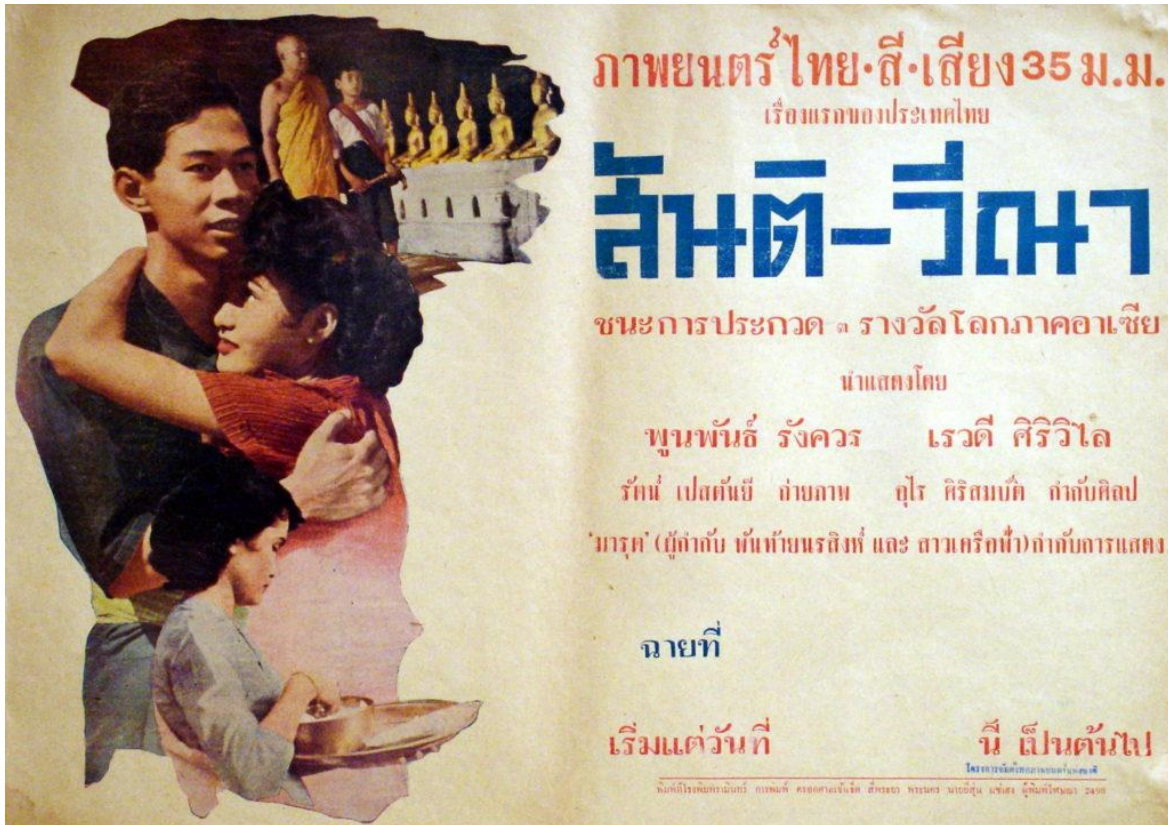
Figure 1: The original poster of Santi-Vina , released in Thailand in 1954.