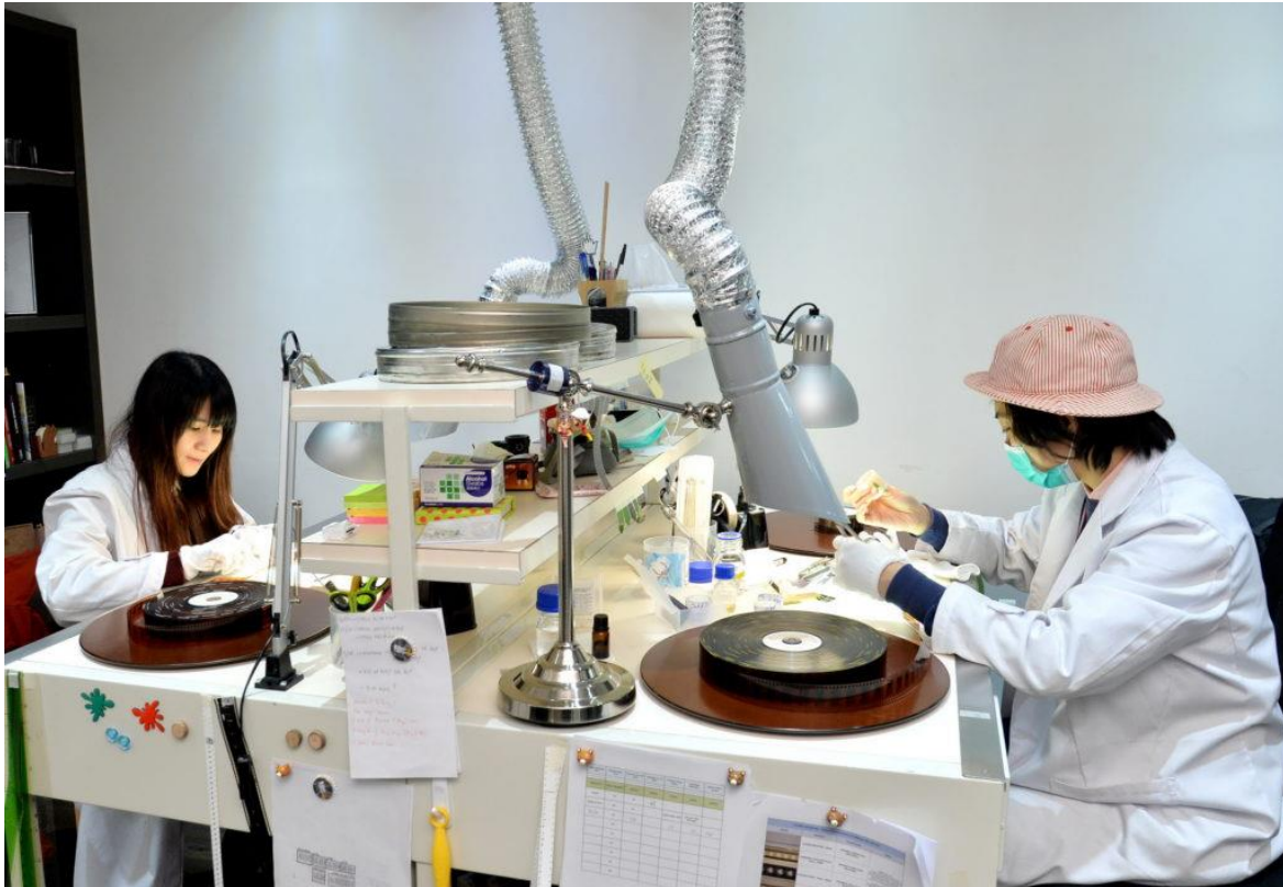
Figure 7: L'Immagine Ritrovata Asia: repair room

4K resolution. Therefore, distributors need to scan and restore films in 4K. The economy and profits are the driving forces, even in this case. Local film studios are approaching us to do the scanning and carry out other processes because they know there is a market for old movies, and it is a “4K market”. For instance, we are currently working with the Criterion Collection right now to restore all of Wong Kar-Wai’s films. We have completed about two thirds of the work and are also contributing to locating the originals.