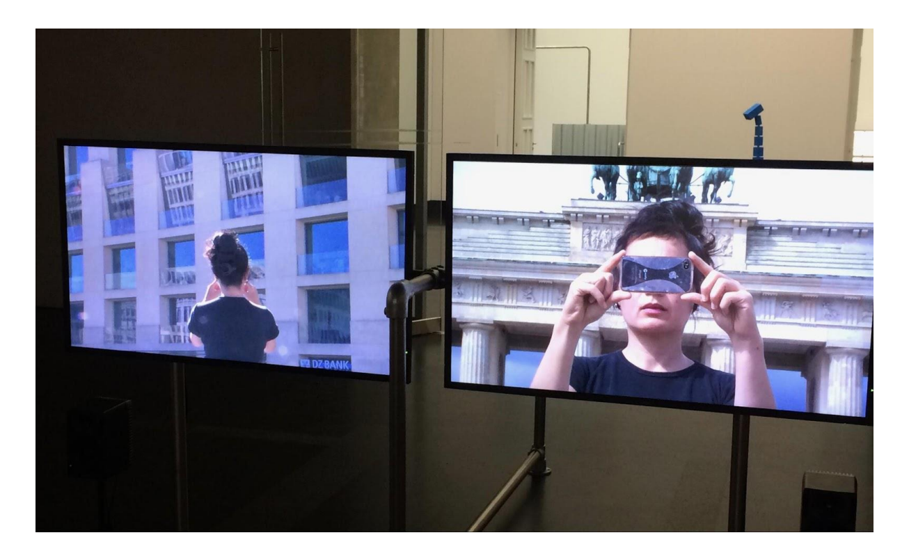
Figure 3: The line of action changes: the eventual countershot to the frontal image of Steyerl in front of the Brandenburg Gate "bends" the direction of Steyerl's gaze by about 45 degrees. Exhibition view of Abstract from the Käthe-Kollwitz-Preis 2019, Akademie.

show footage of charred remains turned over by Steyerl's guide. As before, the interstitial space between the frame of the iPhone screen and the right-hand frame of the video channel is infringed by Steyerl's two fingers and thumbs holding the phone, an additional oblique, half-frame. In the background, a building is discernible but out-of-focus. We can infer from the corresponding shot on the left that the shot of the iPhone is taken from Steyerl's perspective. The soft montage of these shots establishes a telescopic mise-en-abyme of the shot-within-a-shot (within each frame), as the relation between left and right-hand frames implies that Steyerl's head (left) would take the place of a camera recording the iPhone she holds in her hands (right). This nestling of shots binds the metonymic pair of "Berlin" and "Kurdistan" more thoroughly still: in the images of the phone screen, "Kurdistan" is in Berlin. 30