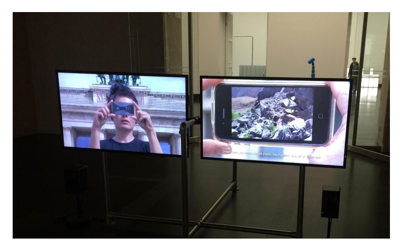
Figure 1: The iPhone as plane and window: Berlin and "Kurdistan". Exhibition view of Abstract from the Käthe-Kollwitz-Preis 2019, Akademie der Künste, Berlin.

by the vanishing point of linear perspective is denied by the phone's position, simultaneously affording Steyerl the possibility of looking elsewhere . Since we can only see the back of the iPhone and are thus denied sight of Steyerl's eye-line, there is a deliberate, constructive ambiguity as to whether she is recording or viewing content on the device. Steyerl figures as auteur and viewer at the same time, recalling Kaja Silverman's concept of the "author-as-receiver" in her reading of Jean-Luc Godard's self-portraits. The prominence of the smartphone in Abstract emphasises this ambivalent function of the "author-as-receiver" and transposes the simultaneously singular and serial qualities of the iPhone to the face of the auteur .