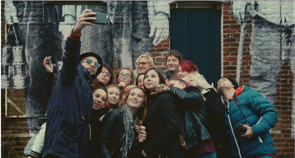
Figure 2: A group of people take a selfie in front of JR's murals of miners. Visages Villages , 2017, dir. Agnès Varda.

miners' images provide an example of phone cameras being used to foster connections with others, celebrating the social, artistic, and political power of mobile phone images.