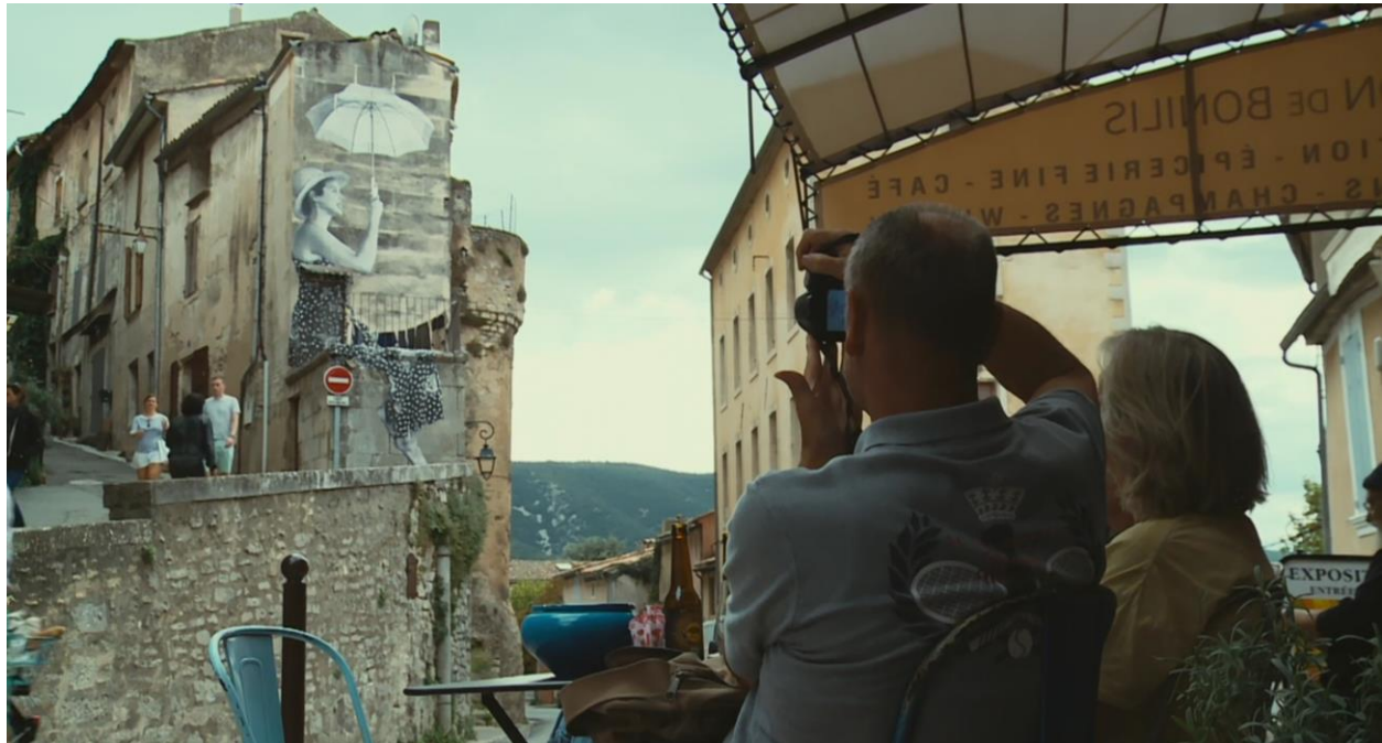
Figure 5: Tourists take photos of a mural of a woman in Bonnieux. Visages Villages , 2017, dir. Agnès Varda.

networks and the “like” economy. We do not hear from the waitress after her boss describes the “millions of photos” taken of her, but it is clear that her image has taken on a life of its own, and the waitress’s complaints bring to mind the difficulties that women in particular face around issues of non-consensual image sharing, as well as contemporary debates about the “right to erasure” and the “right to be forgotten”. 8