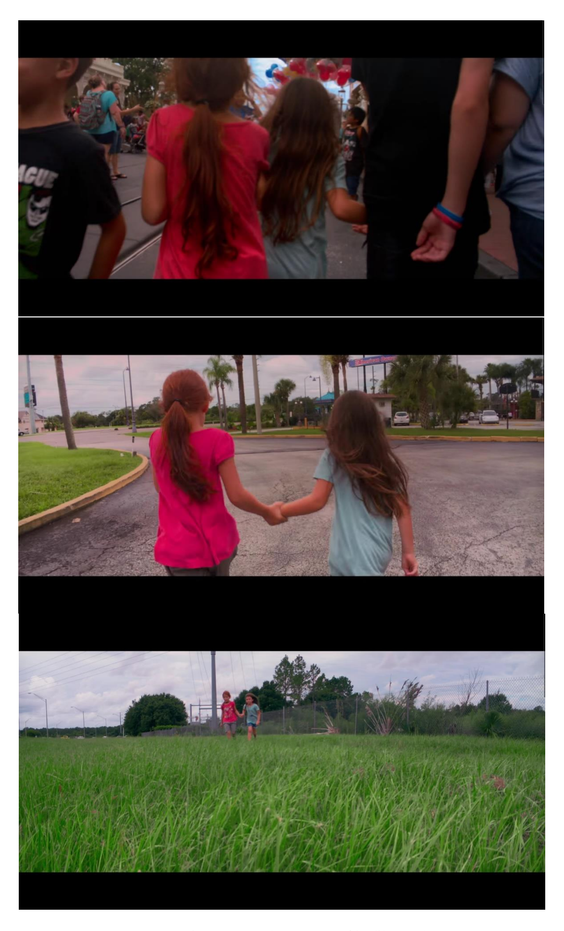
Figure 1, 2 and 3: Images of bodily touch