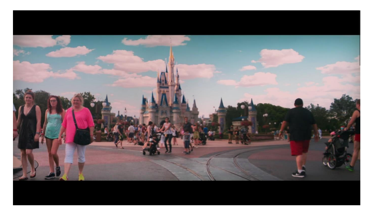
Figure 4: The children are subsumed into the crowd in the final shot

filmed crowd. This move not only imbues iPhone footage with the quality of the real by virtue of its capacity to capture the contingent; it also proffers a definition of realism that emphasises access over reference. The scene is a totemic instantiation of what Mary Anne Doane has called cinema's "ongoing structuring of the access to contingency". <sup>19</sup> By virtue of its ubiquity and consequent capacity for accessing otherwise proscribed spaces, the iPhone is automatically a technology of realism. Lucía Nagib notes that digital cinema can capture "risk, chance, the historical contingent and the unpredictable real" in part because it enables shooting in locations that would be otherwise impossible to reach. <sup>20</sup> Again, this frames the question of realism around the edicts of access.