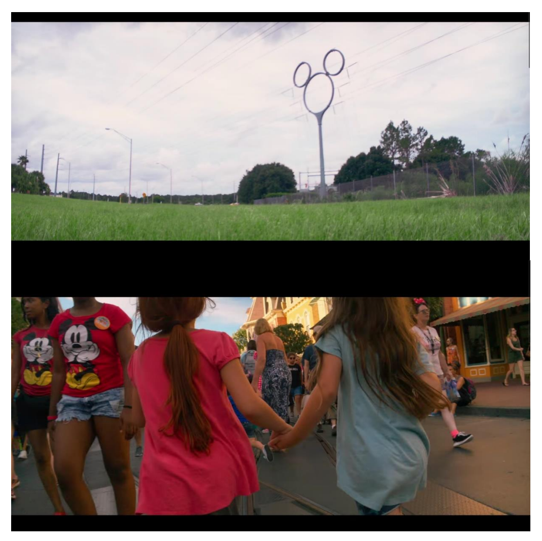
Figure 7 and 8: Disney's fundamental embeddedness within the cultural economy.

squeeze past two women wearing matching Mickey Mouse t-shirts (fig. 8). Here, the radical contingency of the crowd meets the flattening necessity of corporate imperialism. "Huge crowds always transcend the given frame", writes Kracauer.<sup>24</sup> These tourist masses do suggest an outside to the profilmic world, but it is not the unrepresentable social movement and its attendant horizon of alterity, but rather the insuperable cannibalism of Disney in its acquisition of endless new companies and consumers. This is the best way to read the introduction of the music, which distorts an immediately recognisable funk classic into something other yet familiar. This familiarity is the form of the Disney ballad—the kind of melody that would play during a montage of self-discovery in a Disney cartoon. The music is not an arch moment of oneiric fantasy but a further inscription of the insatiable monopoly of Disney.