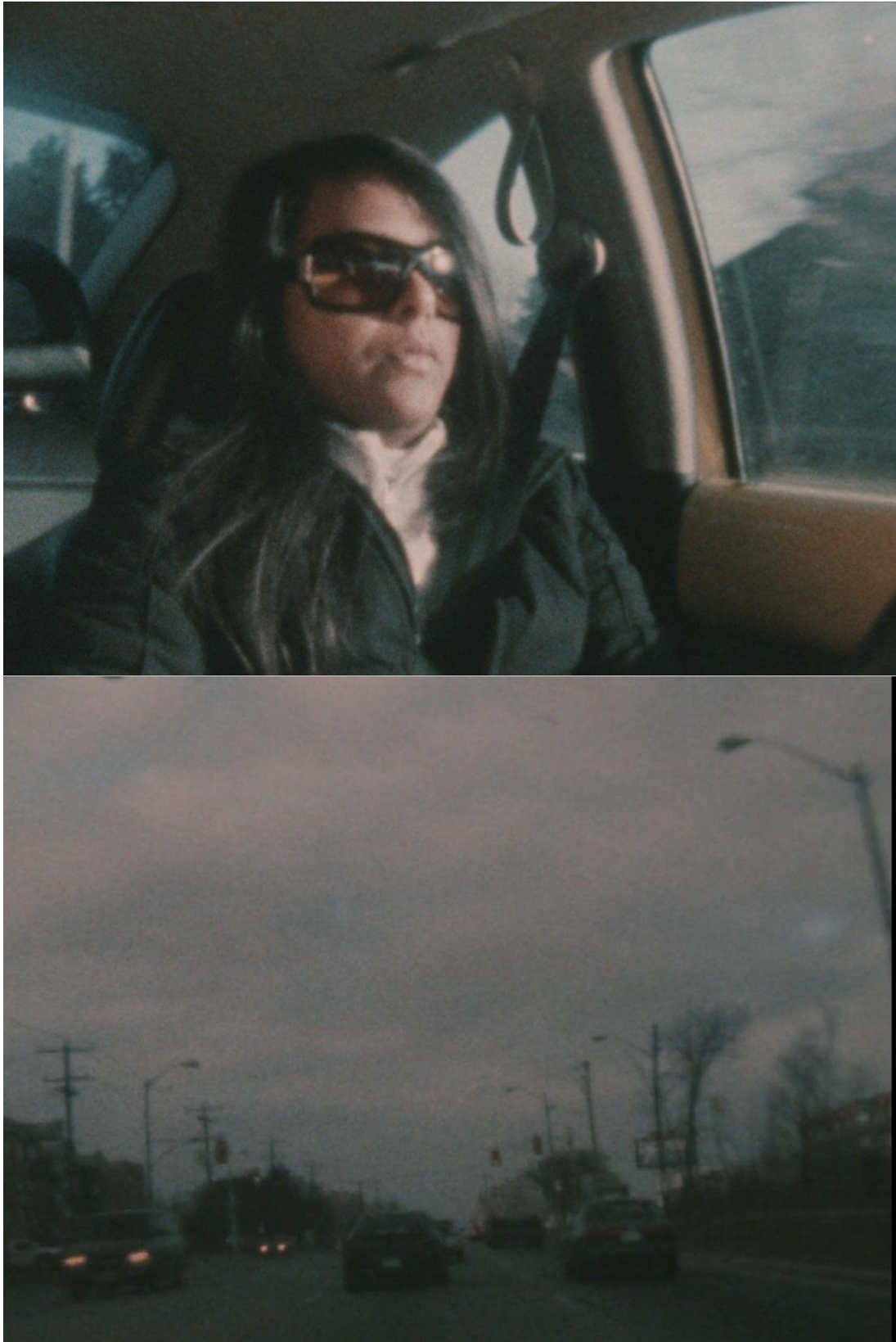
Figure 2 and 3: Stills from Baksh Family Road Trip , 2008.