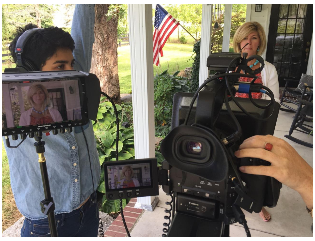
Figure 4. Production still with teleprompter setup.

Each reader was paired with a letter using an idiosyncratic and highly personalised process of "critical casting," wherein readers and letters were carefully matched to encourage generative spaces of dialogue across time (in some cases this meant pairing readers and letters based on common professions, identities, and personal histories, and in other cases pairings were made that, instead, accentuated differences or frictions between contemporary reader and original writer). Readings were filmed outdoors in public space using a portable teleprompter. Filming these unrehearsed readings across multiple takes encouraged a process of real-time listening as readers familiarised themselves with the feeling of embodying someone else's words. And, finally, each reader was invited to respond spontaneously on camera to their reading experience. The finished