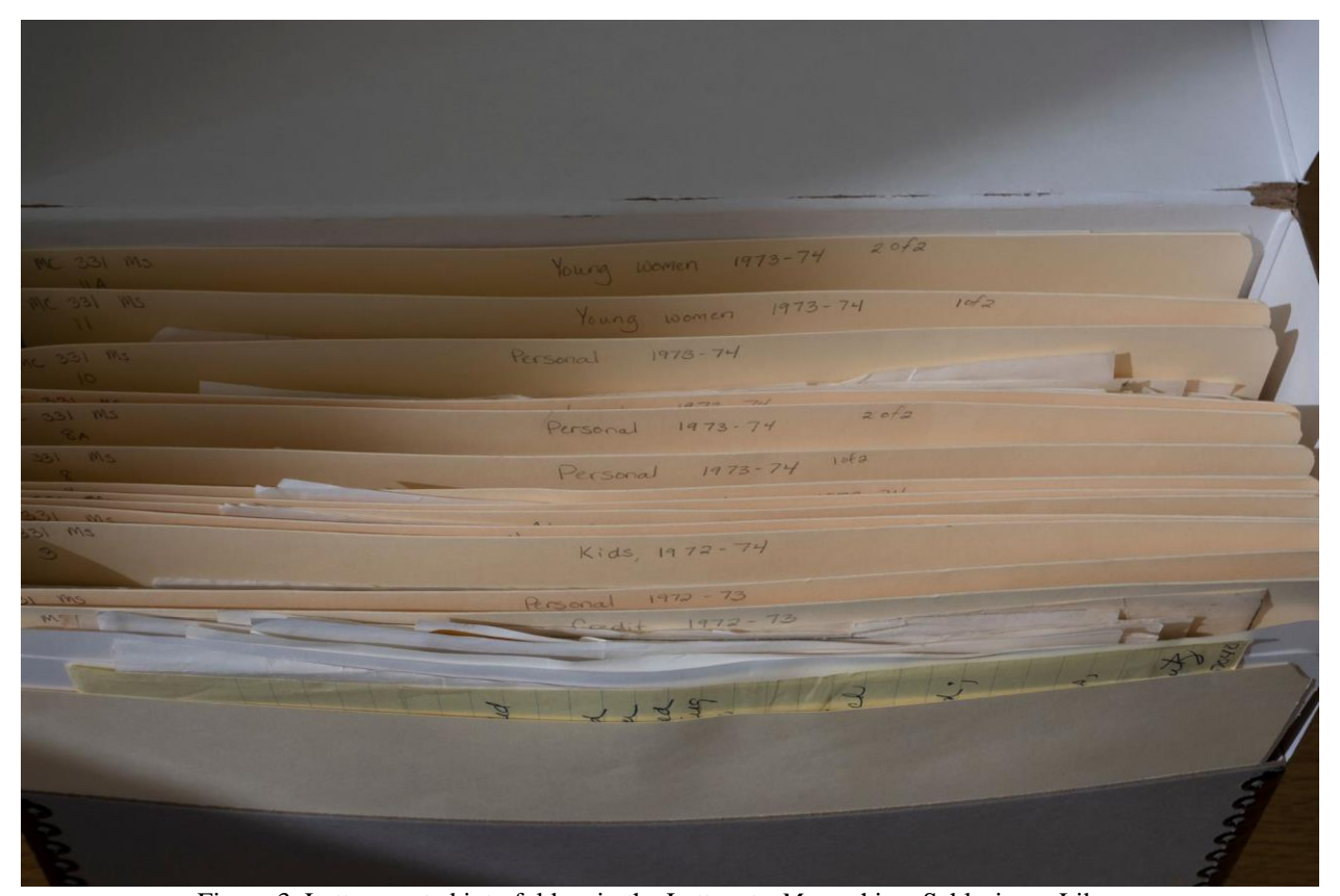
Figure 3. Letters sorted into folders in the Letters to Ms. archive, Schlesinger Library

presentation of the archive. A visitor to the archive is thus invited to engage with the content of the boxes following the interpretation imposed by the archivists at the Schlesinger.