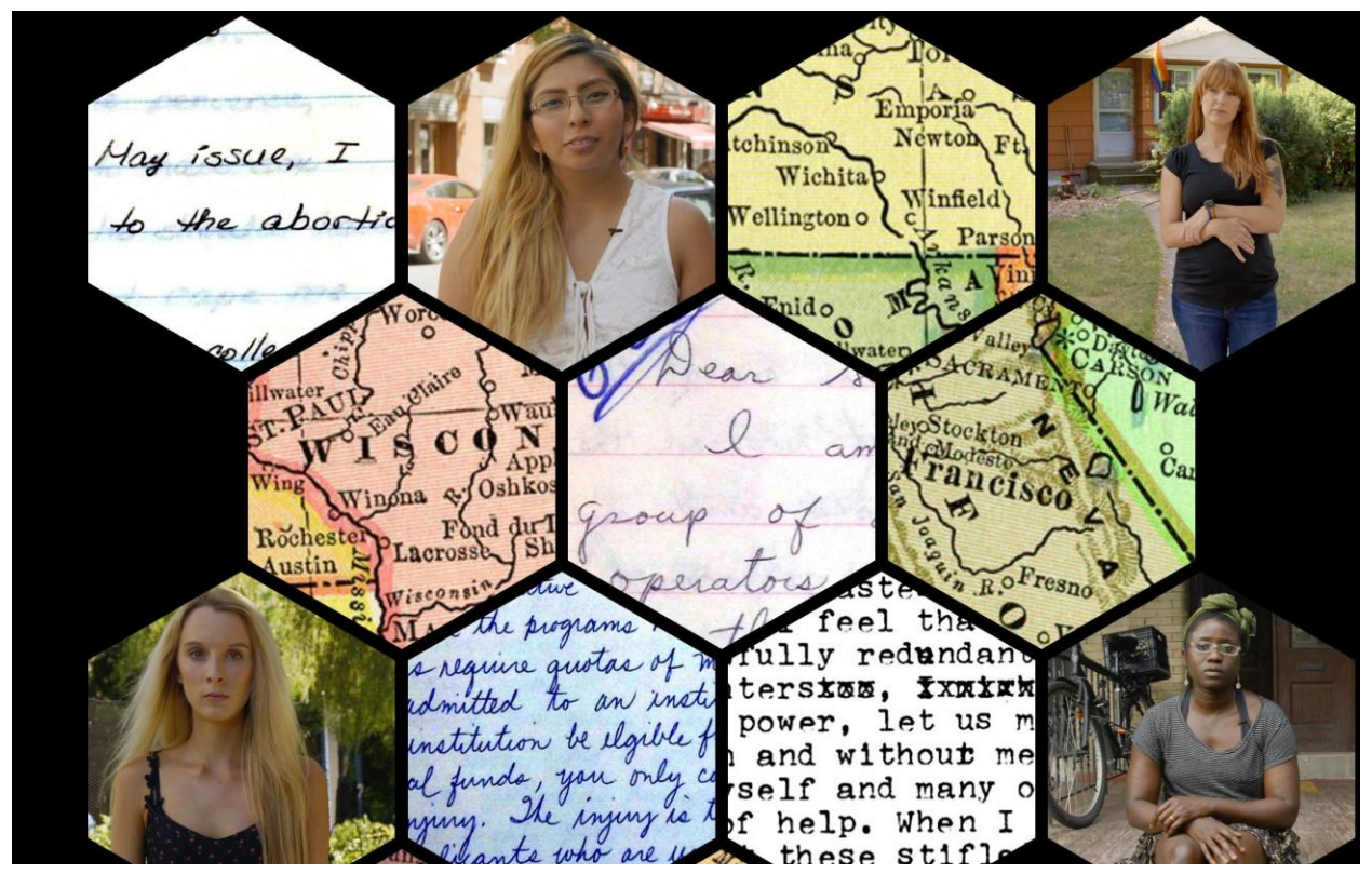
Figure 5. Screenshot interface of work-in-progress web page showing hexagonal grid

After the initial display, videos reorganise and reshape the grid based on the themes as well as the location of the letter readers. This grid would be different for each viewer in two ways: (1) it is first generated based on the viewer's selection of themes, resulting in a grid of overlapping selected themes, and (2) as the viewer selects particular videos to view, the grid transforms based on their journey of viewing. We used a simple query system based on the database from the film, modified to include filenames and paths, and simplified to include themes and location. The reshaping of the grid is the most interesting device, as it results in a different viewing based on the selections of the user. In this sense, it builds on the concepts of polyphonic and fragmented narratives in the field of interactive documentary. For instance, idocs scholars Judith Aston and Stefano Odorico lean on Mikhail Bakthin's concept of polyphony and its relation to dialogue to analyse idocs that not only are collaborative in their mode of participation but also in their aesthetics.<sup>3</sup> In this case,