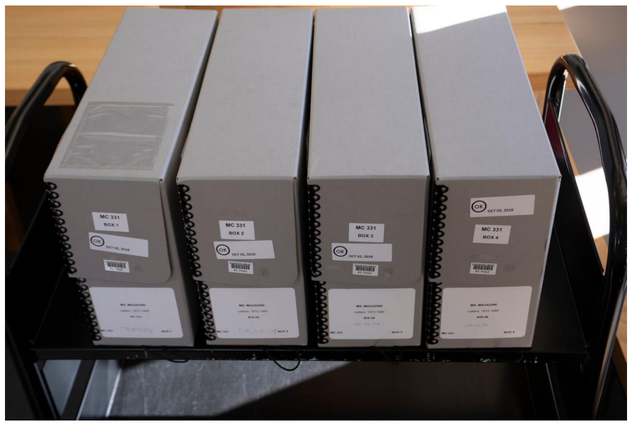
Figure 2. Archival boxes in the Letters to Ms . archive, Schlesinger Library

Due to limited resources, archivists often face the material necessity of deciding what to discard rather than what to save. In this instance, the online finding aid for the 1972-1980 collection states that "because the files of letters were voluminous and repetitious, they have been weeded to approximately half their original volume. No attempt has been made to preserve a representative sample of letters..." Even though this type of winnowing is common practice in the archival world, the act of culling the collection down to half of the original letters already represents one kind of loss in the move from Ms . to the Schlesinger. In addition, the archivists at the library implemented a new system to organise the letters by year as well as broad themes such as "kids," "personal," "young women" as seen in the image below. This new classification imposes a way of knowing the content of the archive, a kind of an interpretation manifested in the material