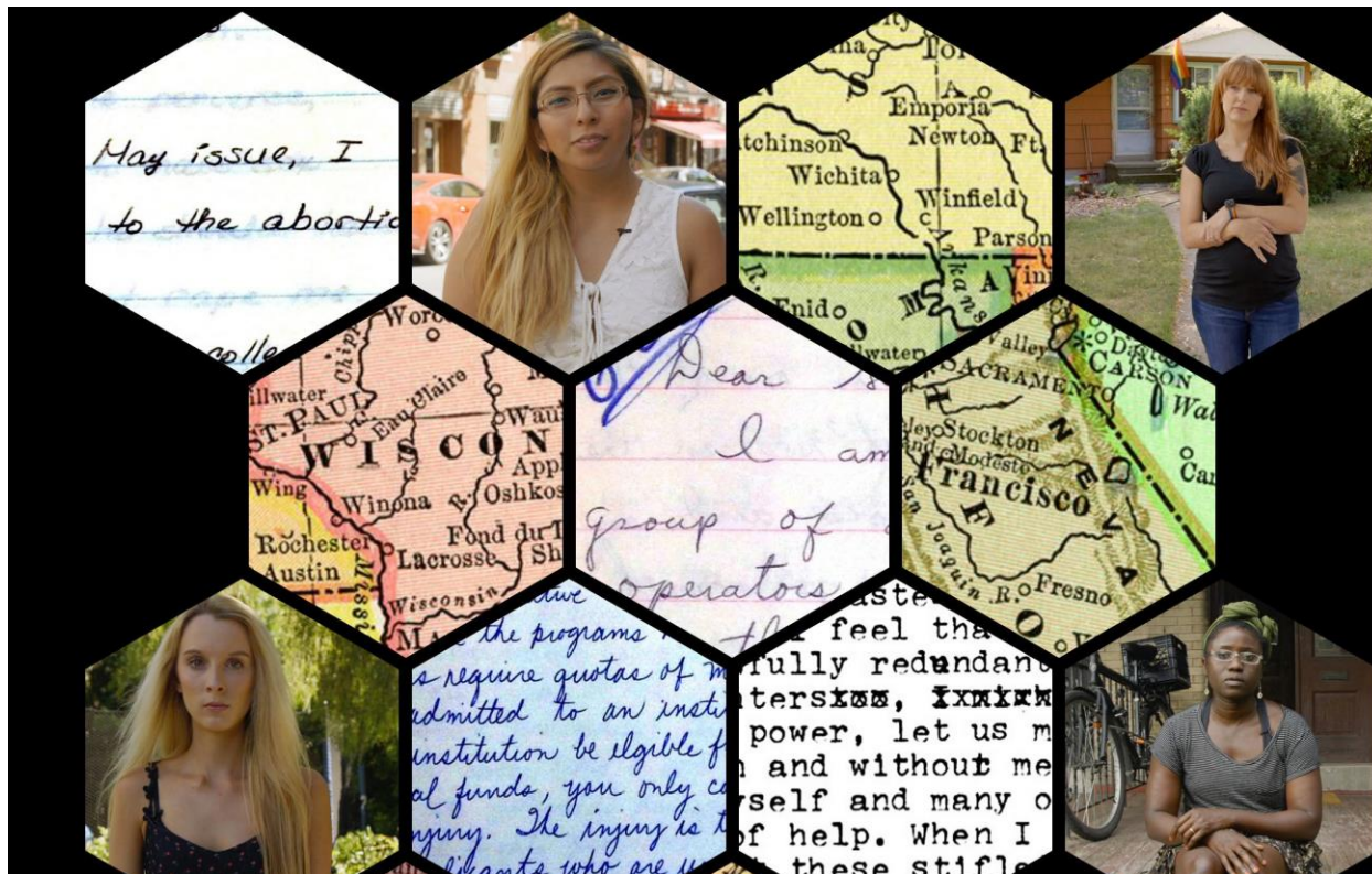
Figure 5. Screenshot interface of work-in-progress web page showing hexagonal grid

After the initial display, videos reorganise and reshape the grid based on the themes as well as the location of the letter readers. This grid would be different for each viewer in two ways: (1) it is first generated based on the viewer's selection of themes, resulting in a grid of overlapping selected themes, and (2) as the viewer selects particular videos to view, the grid transforms based on their journey of viewing. We used a simple query system based on the database from the film, modified to include filenames and paths, and simplified to include themes and location. The reshaping of the grid is the most interesting device, as it results in a different viewing based on the selections of the user. In this sense, it builds on the concepts of polyphonic and fragmented narratives in the field of interactive documentary. For instance, idocs scholars Judith Aston and Stefano Odorico lean on Mikhail Bakhtin's concept of polyphony and its relation to dialogue to analyse idocs that not only are collaborative in their mode of participation but also in their aesthetics. 3 In this case,