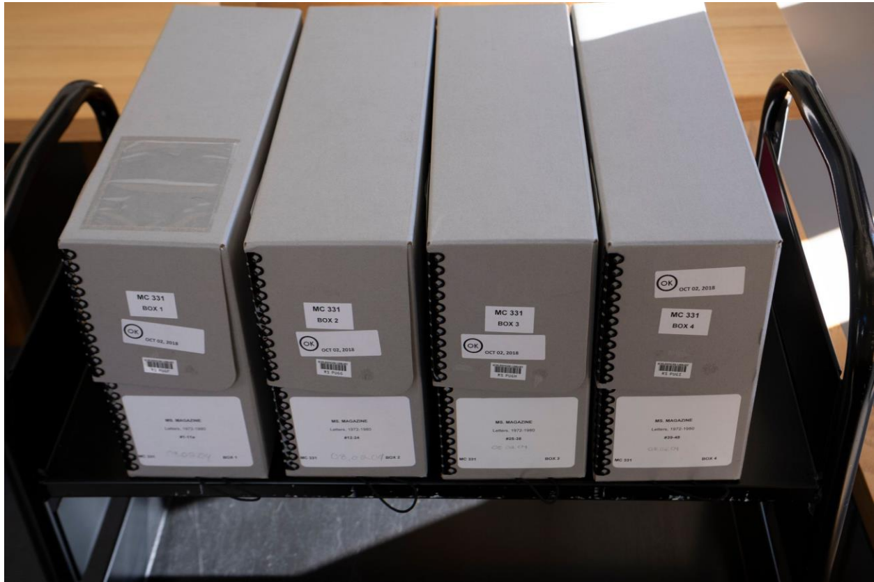
Figure 2. Archival boxes in the Letters to Ms. archive, Schlesinger Library

Due to limited resources, archivists often face the material necessity of deciding what to discard rather than what to save. In this instance, the online finding aid for the 1972-1980 collection states that “because the files of letters were voluminous and repetitious, they have been weeded to approximately half their original volume. No attempt has been made to preserve a representative sample of letters...” 1 Even though this type of winnowing is common practice in the archival world, the act of culling the collection down to half of the original letters already represents one kind of loss in the move from Ms. to the Schlesinger. In addition, the archivists at the library implemented a new system to organise the letters by year as well as broad themes such as “kids,” “personal,” “young women” as seen in the image below. This new classification imposes a way of knowing the content of the archive, a kind of an interpretation manifested in the material