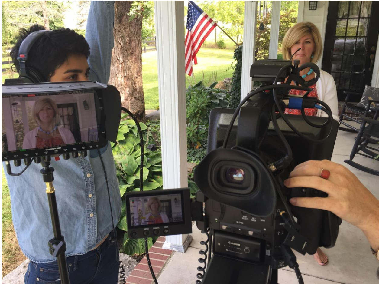
Figure 4. Production still with teleprompter setup.

Each reader was paired with a letter using an idiosyncratic and highly personalised process of “critical casting,” wherein readers and letters were carefully matched to encourage generative spaces of dialogue across time (in some cases this meant pairing readers and letters based on common professions, identities, and personal histories, and in other cases pairings were made that, instead, accentuated differences or frictions between contemporary reader and original writer). Readings were filmed outdoors in public space using a portable teleprompter. Filming these unrehearsed readings across multiple takes encouraged a process of real-time listening as readers familiarised themselves with the feeling of embodying someone else’s words. And, finally, each reader was invited to respond spontaneously on camera to their reading experience. The finished