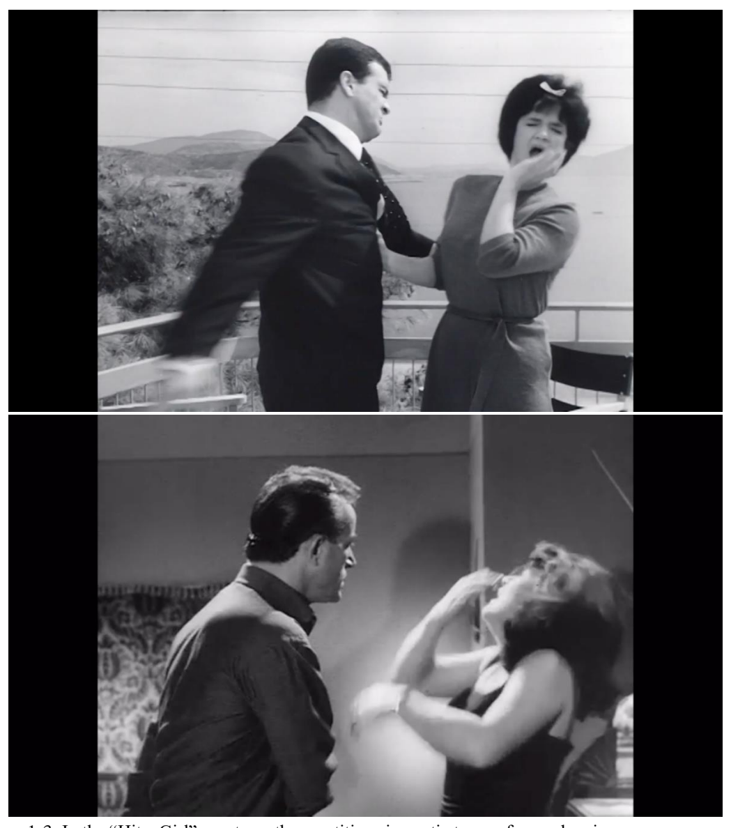
Figures 1-3: In the "Hit a Girl" montage, the repetitive cinematic trope of men slapping women generates a condensed sensory effect that mirrors Braithwaite's experience of viewing the archive. Images from [CENSORED] (Sari Braithwaite, 2018).

Harris' perspective as a viewer echoes Braithwaite's observation of the "sheer unoriginality of these clips side by side" as she spent two years "poring over VHS and DigiBeta copies of the original reels in dark rooms at both the NAA's storage facility in Sydney and the Public Record Office Victoria in Melbourne." The montages encapsulate the onslaught of repetitive imagery within the archive, distilling Braithwaite's protracted initial engagement with the collection's unvaried filmic fragments. Feminist historian Ann Curthoys recalls Braithwaite telling her after the film's premiere that "it was the women's faces in the slapping scenes that helped her