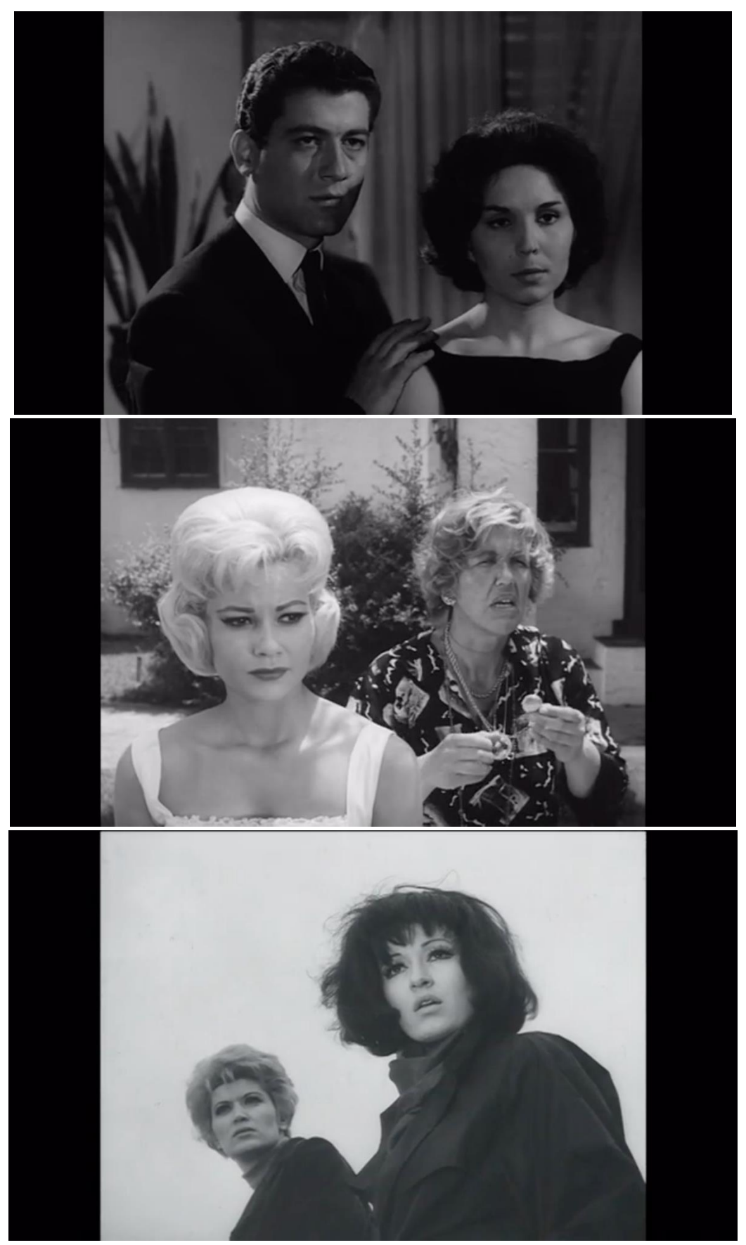
Figures 7-9: The final montage, "The Spectator", underscores spectatorial complicity by featuring on-screen spectators. Images from [CENSORED] (Sari Braithwaite, 2018).