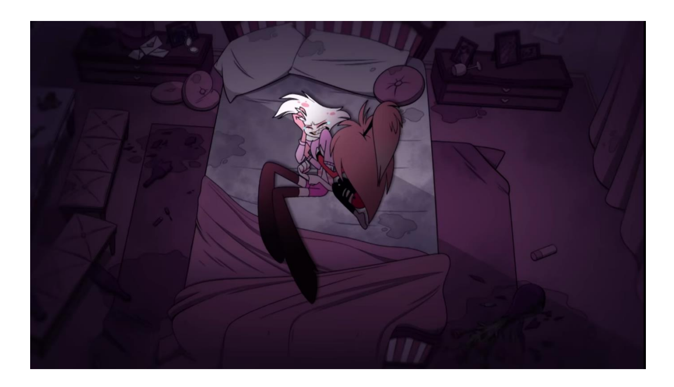
Figure 5. The cut to Cherri Bomb comforting Angel. Addict (Silva Hound and Vivziepop, 2020)

positioned straight above). Unlike on stage, Angel is clutching themself and violently crying. The subsequent cuts have Cherri moving closer (first sitting on the side of the bed) and Angel shifting to their side until Cherri is the one staring up into the camera and Angel is turned away.