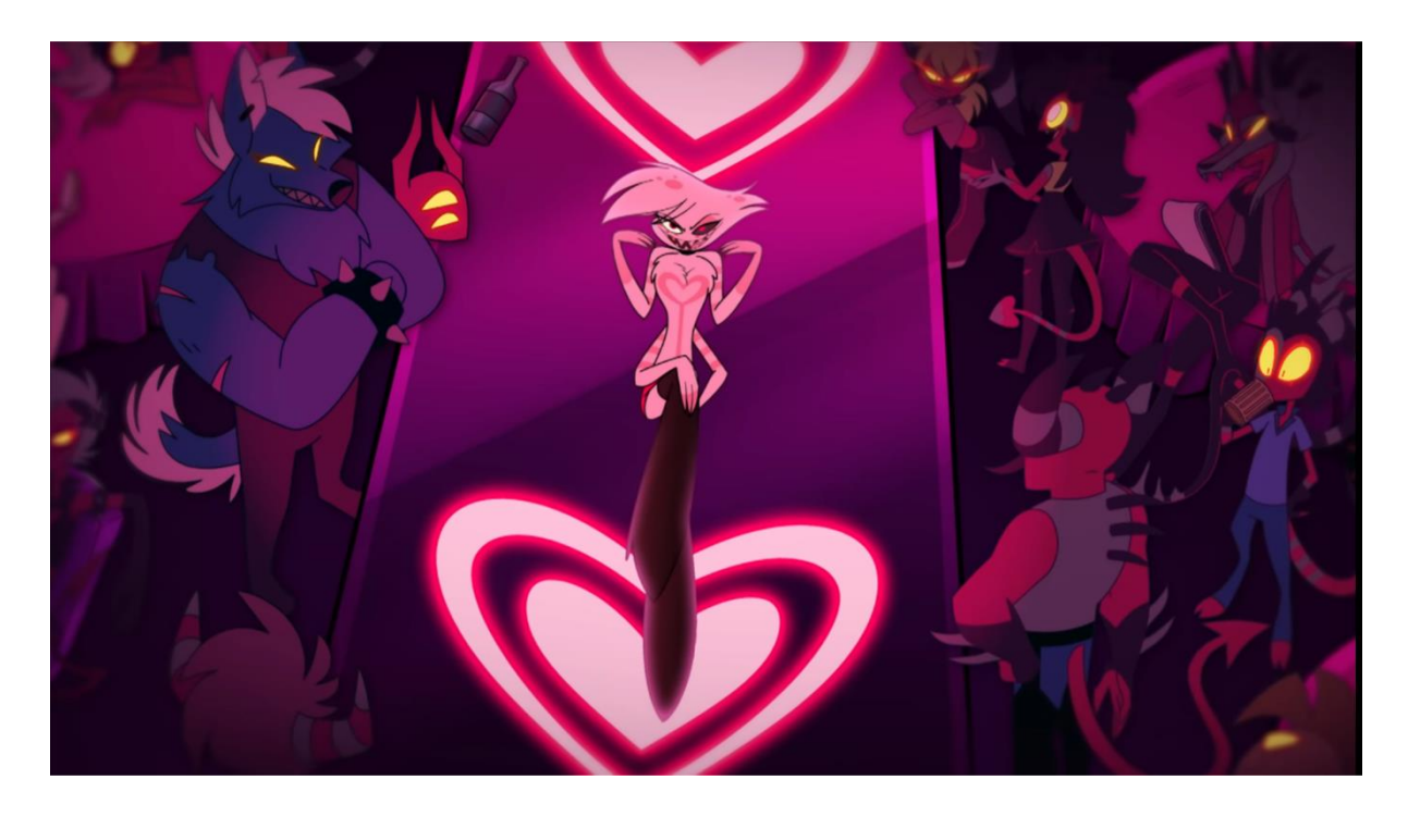
Figure 6: Cut immediately after Figure 5, with Angel smiling up at the camera. Addict (Silva Hound and Vivziepop, 2020)