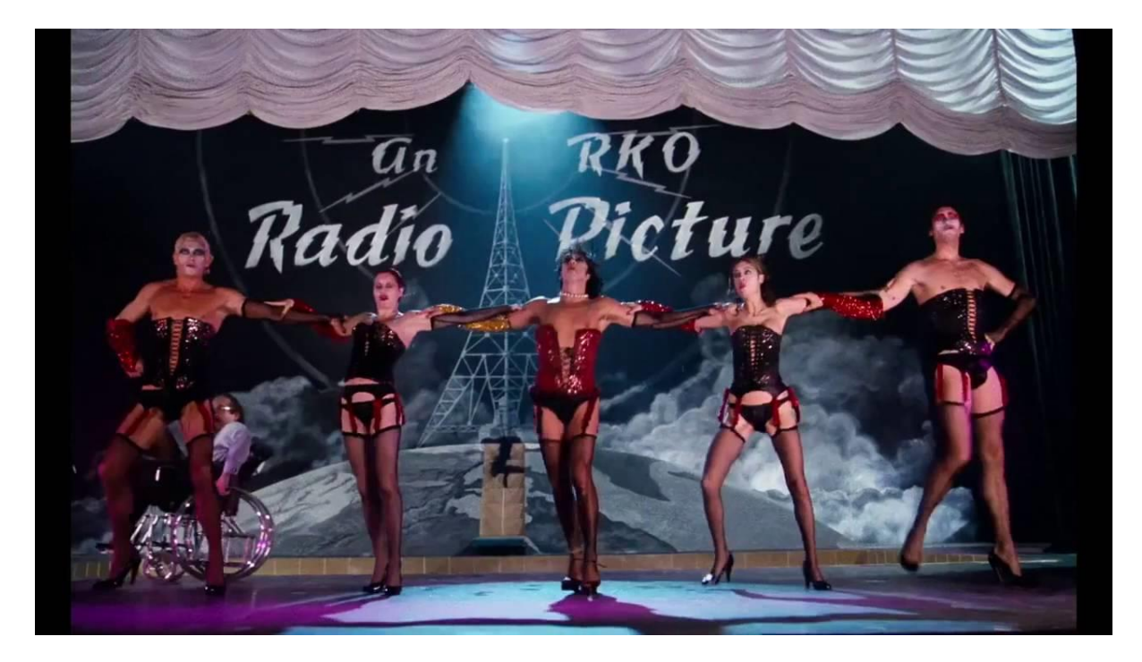
Figure 2. The final chorus line of "Wild and Untamed Thing". The Rocky Horror Picture Show (Jim Sharman, 1975).

The stanza is sung three times, once solo by Frank, and the rest by the company. Frank is not the only "wild and untamed thing" as everyone else joins in singing. With the four back on stage, they are all dressed the same. Only Frank is marked with distinctive colours and make up. For these "wild" and "untamed" things, the rules of society's propriety simply do not apply. Not only that, but the design of their makeup and costumes run counter to normative frameworks of attractiveness. In effect, they adopt a monstrous image to signal their belonging. The water only serves to equalise them more as their makeup runs.