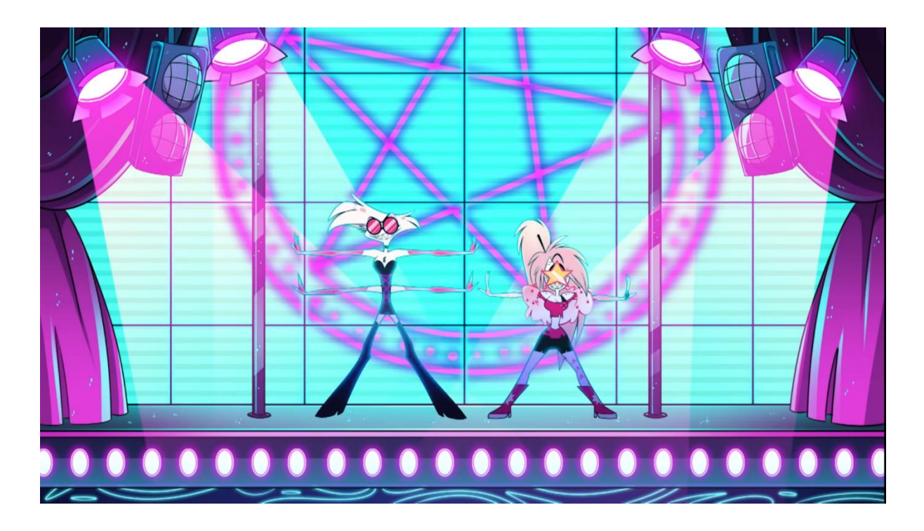
Figure 8. Angel and Cherri dressed up for the final dance and chorus. Addict (Silva Hound and Vivziepop, 2020)

The chorus is sung twice, drawing Cherri and Angel closer and closer together. The first iteration is Angel and Cherri in unison while the second time they trade between the third and fourth lines. The second half is then sung twice more, once to end the song and once more to bridge from the credits to Angel's reprise.