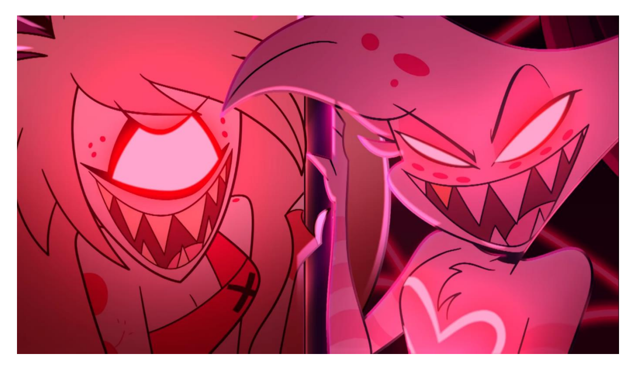
Figure 7. Cherri Bomb and Angel Dust with glowing eyes and sharp teeth meeting beside the static dancing pole. Addict (Silva Hound and Vivziepop, 2020)

As the chorus continues, the scene focuses on the cartoonish representation of a discarded alcohol bottle that transforms into an improvised explosive device as the scene transitions to Cherri's volatile assault on the metropolis outside. The video cuts between shots of Cherri jumping across rooftops and lobbing cherry bombs and Angel who leaves the floor, climbing hands over hands (they are a spider, they have extra hands) up the pole. Over the closing lines of the chorus, the pair are slowly drawn together until they occupy the frame simultaneously on either side of a pole. With a final close-up, Angel and Cherri give their most menacing look with wide smiles filled with pointed "teeth" and pupil-less eyes, glowing like pinkish-red lanterns.