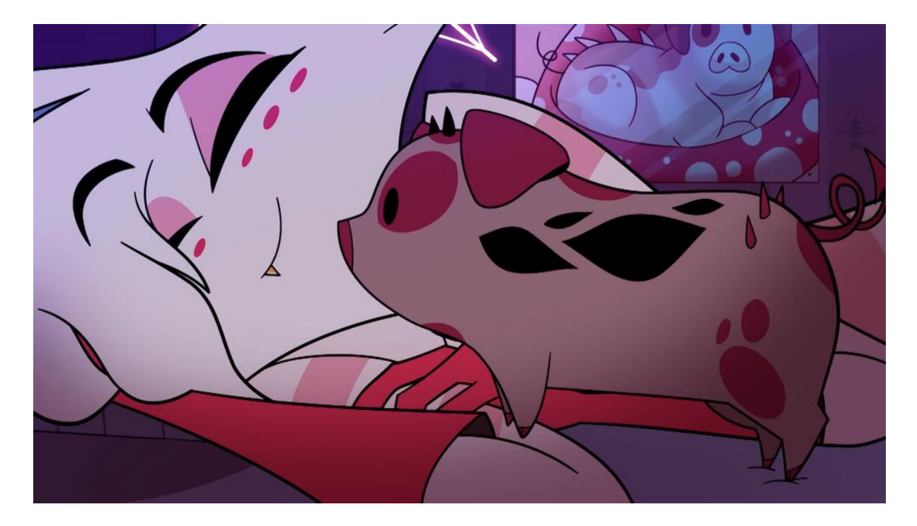
Figure 10. Angel smiling after Fat Nuggets licks their cheek. Addict (Silva Hound and Vivziepop, 2020)