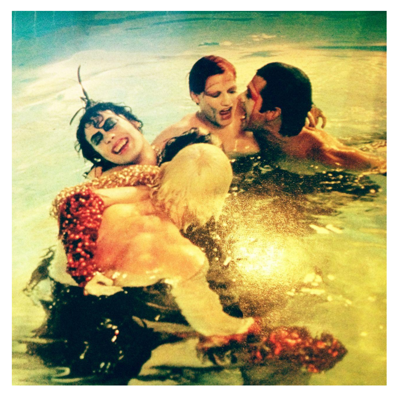
Figure 3. Frank, Rocky, Columbia, Brad, and Janet in the pool above of "The Creation of Adam" kissing and clutching one another. The Rocky Horror Picture Show (Jim Sharman, 1975).

When Frank is hoisted out of the pool on Rocky's shoulders, they fully exhibit the wild and untamed thing as their makeup runs and their perm now plastered to their head. Furthermore, the section's significance comes with the three bottom lines, which can be summed up as "party until life has gone keep[ing] me safe from my trouble and pain." The party, the fun, the extreme life depicted throughout the sequence and the rest of the film is a way of seeing beyond the pain. It is hyper reality of pure sensation. However, this promise of the eternal "erotic nightmare" is interrupted, and the rose tint is smashed. Riff Raff storms in singing "Frank-N-