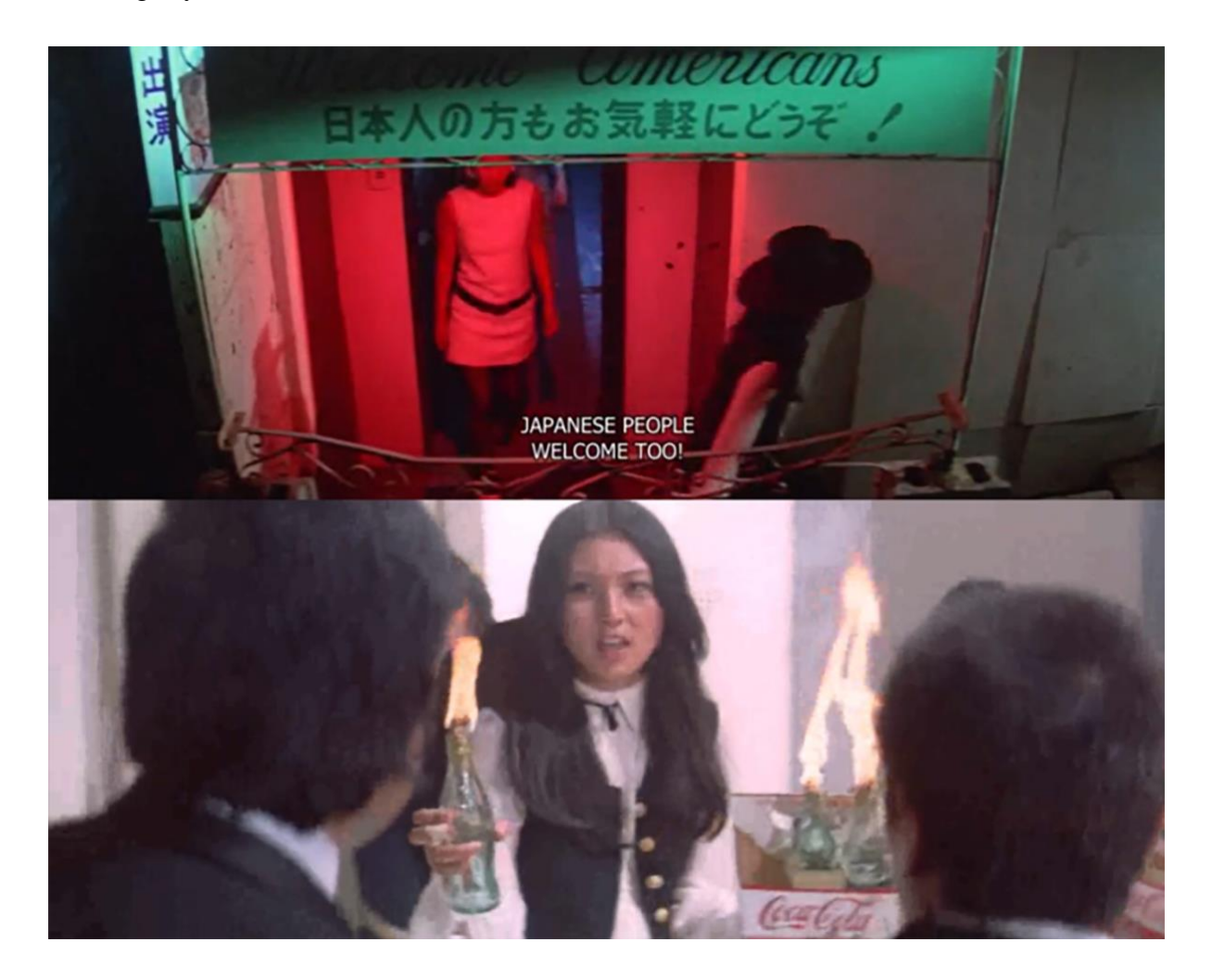
FIGURE 7 — Meiko Kaji walking out of "Welcome Americans" bar (above) and burning Coca Cola bottles (below), in Sex Hunter (1970), © NIKKATSU

emerging from a bar whose sign states "Welcome Americans... Japanese people welcome too", displaying them as inferior in their own country. Later on, wealthy Americans attempt to force themselves onto the all-female Japanese gang after they've been sold out by the male rival gang, but are stopped by Kaji breaking in just in time with an arsenal of Coca Cola bottles fashioned into Molotov cocktails, burning the party to the ground with this epitome of American consumerism. Stray Cat Rock is thus concerned "with the strength and rebellion of youngsters against that background", disenfranchised by the post-war attitudes of a Japan suffocating under America's influence and the ensuing chaos of reactionaries vying for their former glory.[50]