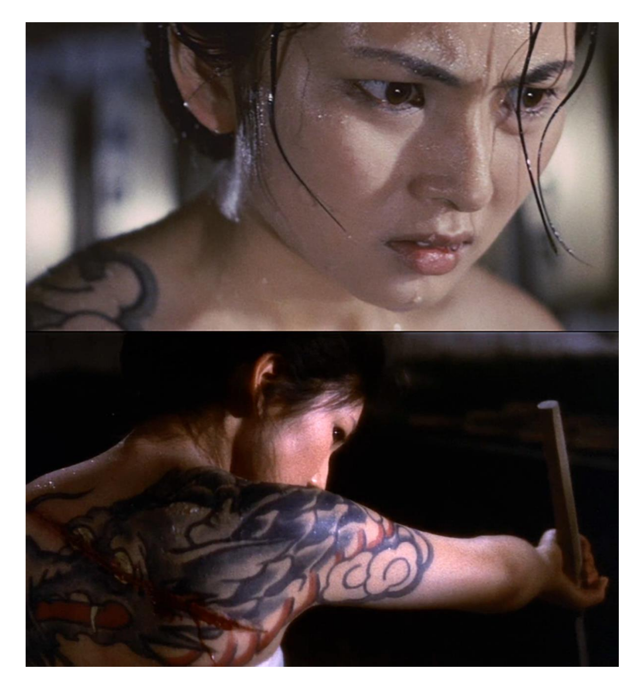
FIGURE 9 — Meiko Kaji regretting her violent actions (above), and with dragon eyes slashed out (below), in Blind Woman's Curse (1970)

This suggests a problem in the method of production in the Japanese film industry of the 1970s, considering their simultaneous profiting from and disownment of violence. While the American 1960s counterculture paved the way for the dismantling of the Hollywood studio system for the new era of independent productions that Grier found herself in,[57] studios became more powerful in Japan as they co-opted the sentiments of the time, engineering a stronger cinematic culture to stand against their American contemporaries.[58] These were not independent filmmakers tapping into the taboo tastes of an underground audience; they were