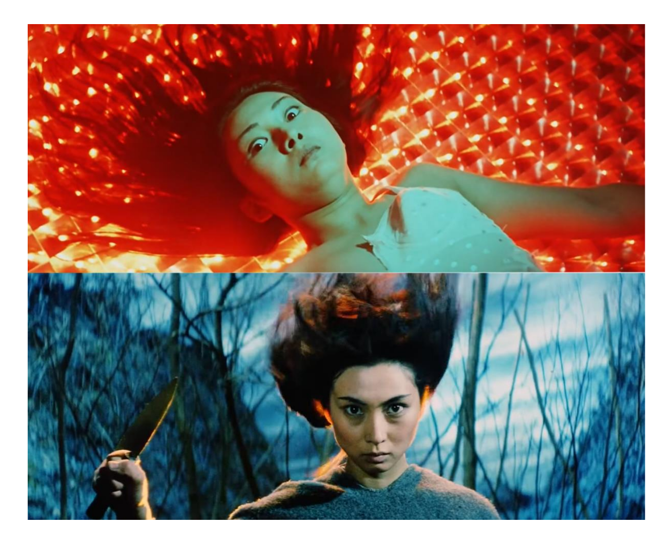
FIGURE 2 — Meiko Kaji's "dangerous, iconic stare", in Female Prisoner Scorpion (1972) (above) and Jailhouse 41 (1972) (below)

In her silence, Kaji's voice is instead felt through song. Fundamental to Kaji's popularity was her singing a new theme song for each film,[19] "emoting the lyrics... as she would with dialogue from a film, playing the character behind the words."[20] As Michel Chion writes, "the presence of a human voice instantly sets up a hierarchy of perception."[21] The voco-centricity of Kaji's singing leads her voice to take precedence over all other sounds. When she sings, the audience immediately becomes transfixed, her voice dominating all other sonic elements. As Kaji reveals, "it was common back then... for performers to sing the theme songs for the films they were in."[22] However, not all actresses during this time could handle the singing aspects of their roles.[23] What made Kaji so remarkable was that she possessed attractiveness in both her appearance and voice, thus not only surviving in the tough environment, but flourishing in it. Kaji can be compared to Michael Bronski's assessment of Judy Garland, for "when she sang she was vulnerable. There was a hurt in her voice that most other singers don't have".[24] It is the vulnerability in her singing that allows her to explore the