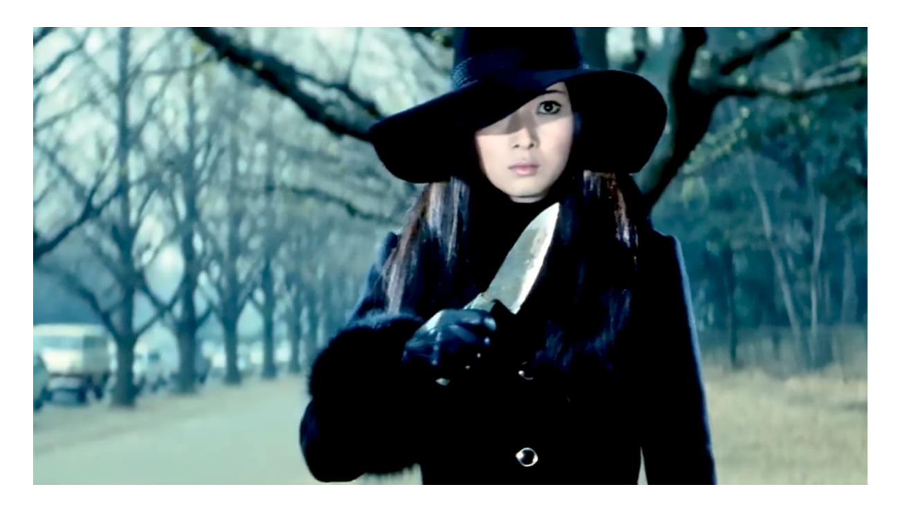
FIGURE 1 — Meiko Kaji, "hauntingly beautiful, enigmatic and seductive", in Grudge Song (1973), © TOEI COMPANY

instrumentation, sentimental lyrics and evocative vocals (the songs mostly being those she composed herself). This allowed for her "memorable outlaws bent on revenge" to stand out from the many other women acting in very similar films at this time, as the songs are what made her films unique.[9] She was one of the first Japanese women on screen to embrace violence and be widely loved for it, joining contemporaries who, as Alicia Kozma writes, performed "complex female characters whose actions openly question normative ideas of appropriate female action and gender stratification", with her "radical representations of female sexuality" creating an interesting microcosm of the changing times.[10] To this end, "the star persona of Meiko Kaji is located between the extraordinary powers of a castrating gaze and the existential malaise of a female killer," a persona she embraced yet which ultimately stifled her growth.[11]