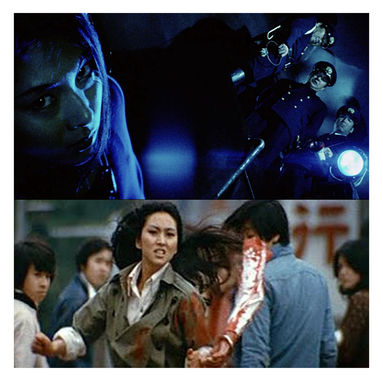
FIGURE 3 — Meiko Kaji tied up on prison floor in Jailhouse 41 (1972) (above), and running away with severed arm in Beast Stable (1973) (below)

Through the use of song, Kaji's plight becomes intimately felt by the spectator, as an entity driven by a singular purpose, prevented from ever achieving happiness. Similar to Bjork's singing in Dancer in the Dark (Lars von Trier, 2000) whenever reality becomes too painful to bear, so does Kaji sing to escape the brutal prison. Throughout these films, important moments - of escape, of violence, of reflection - are accompanied by the same song, lifting the themes outside of painful reality into a fantastical musical world that allows the message to be heard clearly by the spectator. As Steven Feld argues, knowledge is only gained "through an ongoing cumulative and interactive process of participation and reflection", so the repetitiveness of the theme song heightens the audience's grasp on the meaning behind the