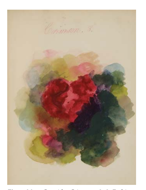
Fig. 1. Mary Gartside. Crimson , 1808. Etching (?) and watercolour. Originally published in An Essay on a New Theory of Colours .