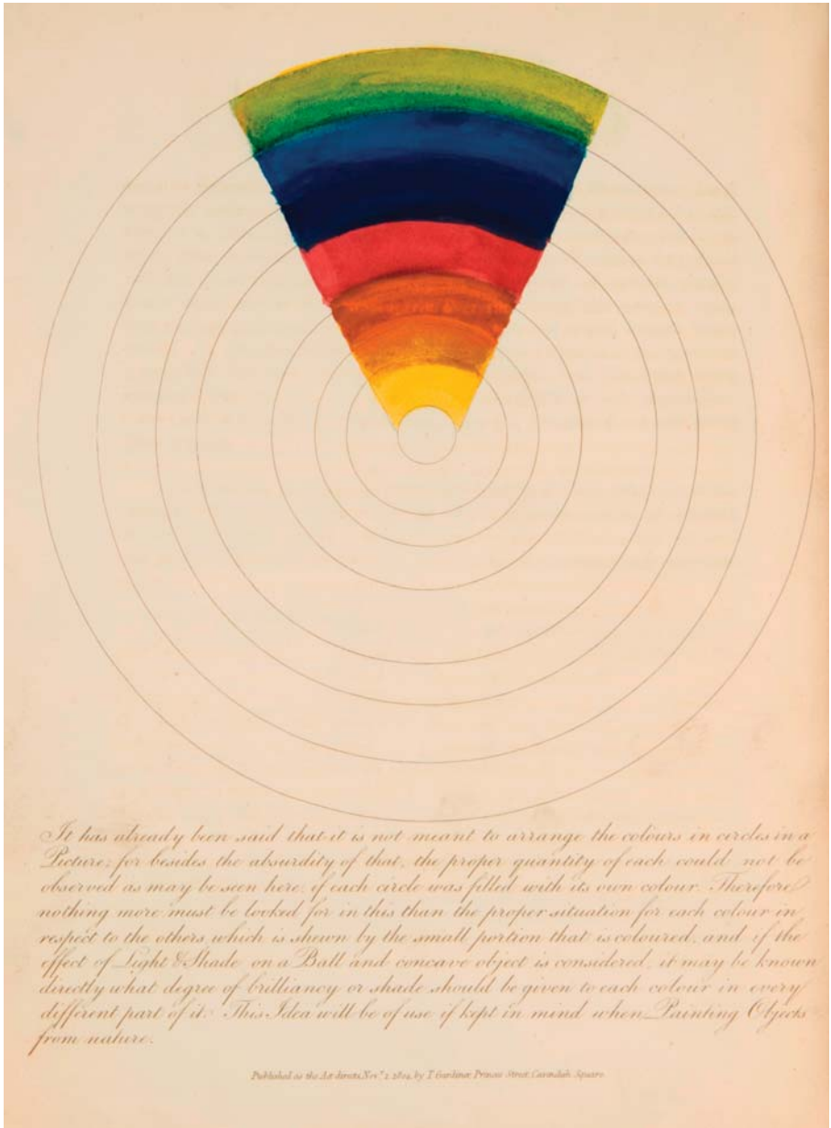
Fig. 4. Mary Gartside. Colour Circle , 1808. Originally published in An Essay on a New Theory of Colours .