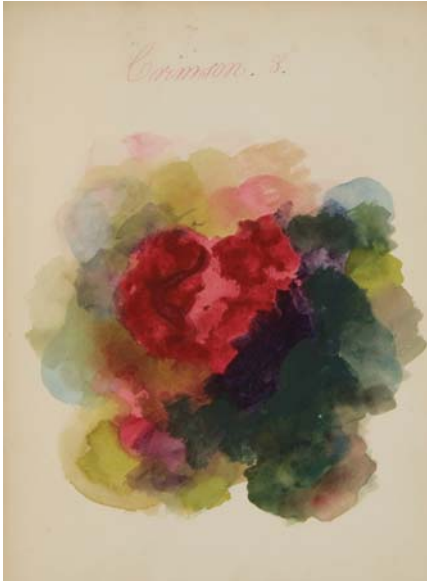
Fig. 1. Mary Gartside. Crimson , 1808. Etching (?) and watercolour. Originally published in An Essay on a New Theory of Colours .