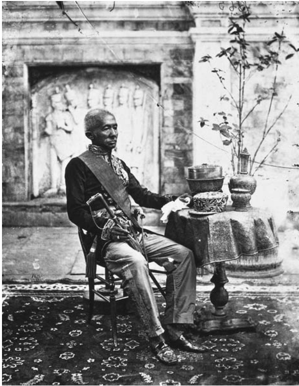
Fig. 5. John Thomson, The 1 st King of Siam, King Mongkut, in western style state robes, Bangkok, Siam, c. 1865-6 . Photographic glass plate © Wellcome Library, London.

With the concept of a photographic Buddhist icon thus understood, the use of such an icon as a gift to Queen Victoria can be adequately explored as part of the power struggle and “asymmetrical exchange of glances” that characterises the relationship between viewer and icon. 25 A particularly interesting facet of the icon is that it retains a sort of transference of power due to its lifelike nature and physical link to figures of power, whether a deity or a King. A Buddhist icon not only borrows power from its double, in this case King Mongkut, but also lends power and legitimisation to its physical embodiment. As Faure explains, “Icons, in their ritual context, are essentially traps, devices for capturing power ( li ) ... [they] permit an articulation between different symbolic orders (the stupa, the human body, the social body, the cosmos).” 26 There is not only a link between Buddha and the icon but also between the viewer and Buddha. This corporeal link, expressly made through the substitute body of King Mongkut in the daguerreotype gifted to Queen Victoria,