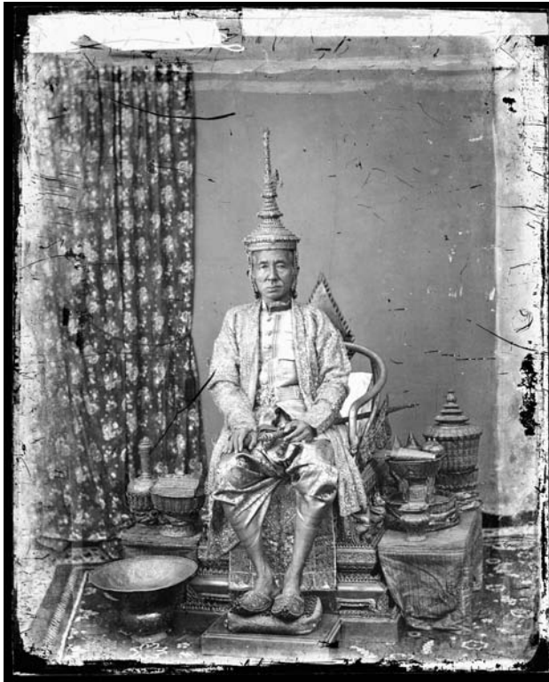
Fig. 3. John Thomson, The 1 st King of Siam, King Mongkut, in state robes, Bangkok 1866 , 1866. Photographic glass plate © Wellcome Library, London.

To speak of an icon as a container or a mask is reminiscent of the terminology utilised in notable texts about the nature of photography. Roland Barthes spoke of photography's dependence on the mask in order to generalise: "the mask is meaning, insofar as it is absolutely pure (as it was in the ancient theatre) ... The Photograph of the Mask is in fact critical enough to disturb ..." 21 Siegfried Kracauer wrote that "photography brings to the fore the entire natural shell," or the natural container, and in this case it is a shell for an animated icon. 22 To further the comparative similarities between the effectiveness and functioning of Buddhist icons and photography, the strength and the power of an icon is integrally associated with its physical connection to the Buddha. Faure asserts that, in this relationship, "the existence of a direct link, historical or metaphysical, with the ultramundane prototype is essential ... Just as the vera eikon was imbued with the power of Christ through the impression of his face, the efficacy of Buddhist icons derives from their initial contact with Buddha." 23 This