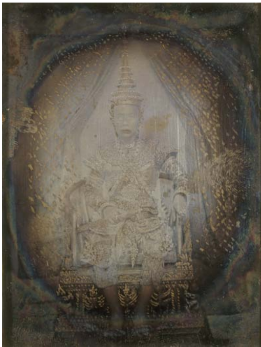
Fig. 1. Luang Wisut Yothamat (Mot Amatyakun), Director for the Siam Mint and Royal Photographer, Mongkut, Rama IV of Siam (King of Thailand) , r. 1851-68 (c. 1856-7). Daguerreotype with added gilt.

illuminated with gold leaf and gold dust. The spectral trace of King Mongkut is delicate and evanescent, and the mirror-like polished surface of the daguerreotype creates an auratic halo around the king's gracefully seated position. This pose references Buddhist visual symbolism, in which different postures represent a spectrum of importance from a deity to a major Buddha, and within which the seated position is generally associated with the latter. "Buddhist iconology has valorized stillness;" their immobility signals the absence of passions and desires. 18 The king is portrayed in full royal regalia, including the crown that resembles the fleshy extension, formally known as the uṣṇīṣa , normally depicted in icons of Buddha as a sign of enlightenment. The subtle rainbow colors appear and disappear, like the image of King Mongkut as Buddha, while the viewer turns