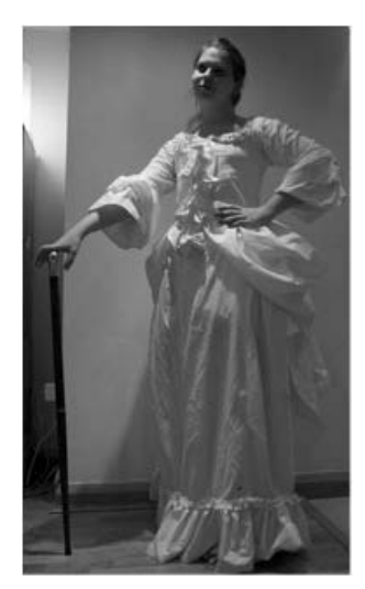
Fig. 10. Reproduction 'Macquoid' polonaise.