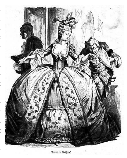
Fig. 5. 'Lady in Hoop Dress', from Braun & Schneider's The History of Costume , c.1880.

To present women in sack-backed gowns - also known as the 'robe à la française' — was by no means an unusual choice for a production of Sheridan. The style has been taken as representative of the time in which the story was set, although many theatres have chosen to style the actors in the fashions of the late 1770s, when the play was written. This decision is entirely at the discretion of the director and designer, and makes very little difference to the plot or characterisation. Recent scholarly work on eighteenth-century dress presents conflicting opinions as to which style is most representative of the era. In Historical Fashion in Detail, Avril Hart and Susan North declare that "of all the eighteenth-century styles it is the polonaise that has caught the population as the embodiment of eighteenth-century