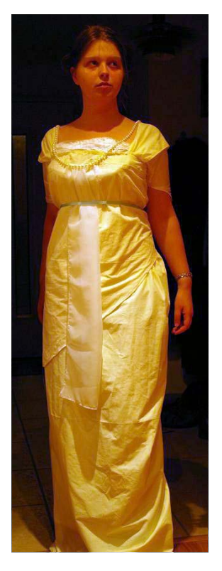
Fig. 4. Reproduction of the 1912 'Neilson-Terry' dress.