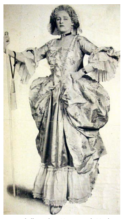
Fig. 3. Phyllis Neilson-Terry as Lady Teazle in The School for Scandal, His Majesty's Theatre, 1912.