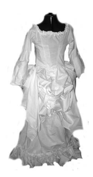
Fig. 8. Robe à la polonaise assembled according to Macquoid's designs.