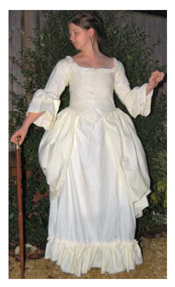
Fig. 9. Reproduction extant polonaise.

allowing for a stomacher upon which costly silk and embroideries could be displayed to their best advantage. It is clear from the photographs of Neilson-Terry and Lohr that both actresses refused to discard their contemporary, bust-enhancing S-shaped corsets. However, Tree and Macquoid felt the need to entice their audience as well as desiring authenticity. It was mainly the shape of Macquoid's gowns, rather than the colours or trimmings, which betray that they were made in the 1908-13 period. Every generation's interpretation of the past, however, is inevitably influenced by their own style, and twentieth/twenty-first century designers have often made concessions in plays and films to make historic costumes more alluring to a modern audience. These are alterations we might not even recognise until our own fashions have once again changed, and is at the time of writing particularly evident in BBC television adaptations such as The Forsyte Saga (1967) Sense and Sensibility (1971), Northanger Abbey (1986) and