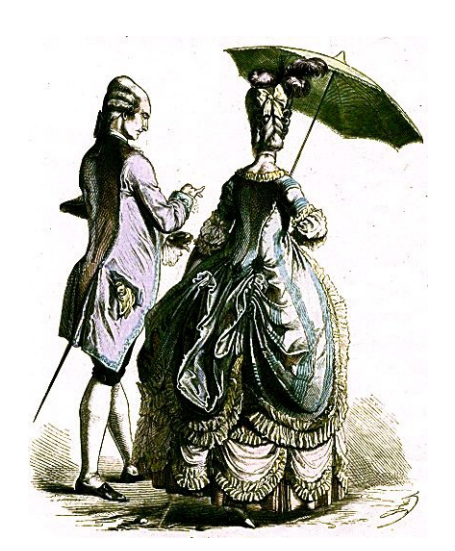
Fig. 1. 'Dress of 1780', from Braun & Schneider's The History of Costume, c.1880.

drama. The designer chose to replicate the fashions of the mid 1760s because he believed the period was "novel and very representative of 1909. Courtesy of the Herbert Beerbohm the last phases of early Georgian decoration and Tree Archive, University of Bristol Theatre costume".6 However, when studied alongside