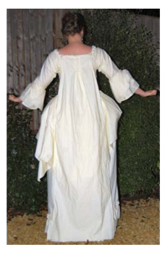
Fig. 11. Reproduction française assembled according to extant samples.

The addition of a 1910s corset was undoubtedly the alteration that most changed the entire feel of the outfit. My pose, as well as the hang of the dress and the fit of the bodice, was irrevocably altered, and I found myself in a strange limbo of hip-length, tight-waisted corset coupled with extravagantly draped skirts over side hoops [Fig. 11]. Such a condition cannot have helped actresses to 'become one' with characters from almost two hundred years in the past. However, this comment is a particularly twenty-first century take on characterisation. Michael Booth refers to the choice actors had when approaching a part, whether to play it 'emotionally' or 'intellectually'. Today, we might assume that both have equal relevance and importance. But throughout the nineteenth century the question of whether to "feel the emotions he portrays or simulate them by outward forms", an idea crystallised by Diderot in 1830, was still of relatively small significance.<sup>14</sup> Costumes undoubtedly helped an actor to express either emotion or intellect, but the relation of 'the self' to 'the character' is a distinctly modern theatrical contemplation. However, without a familiar body shape before them, the passionate yearning of critics to 'revive' elements of Georgian style in dress would probably not have occurred. Without a touch of sexual allure, as well as familiarity, the costumes might well have been viewed simply as quaint, laudable and totally unsuited to the modern world.