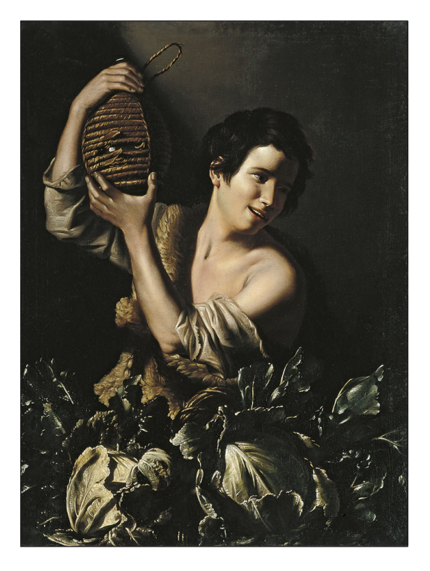
Fig. 2. Tommaso Salini, Young peasant with a flask, c.1615–1620, oil on canvas.

No scholar has published an alternative attribution for the Boston Poppies , which is startling because it has many formal characteristics in common with the other works that have been attributed to Salini. The worn wickerwork flask is a reprise of the one in Young Peasant with a Flask (c.1615–1620;Thyssen-Bornemisza Gallery, Madrid) [Fig. 2], and another in The Old Glassman (c.1615–1620; formerly Badminton House, Gloucestershire) [Fig. 3]. It must also be remembered that Baglione highlighted Salini's work as a still life painter when he said that he managed to "place flowers and leaves in vases, with various whimsical and strange inventions," a description that is highly suggestive of this piece.<sup>15</sup> It is important to