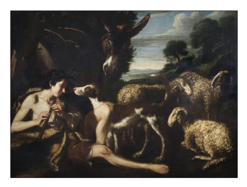
Fig. 6. Attributed by the author to Tommaso Salini, The Piping Shepherd Boy , c.1620–25, oil on canvas.

The Foundling Shepherd is a picture of high quality; some of the paintwork is obscured but the canvas does not display obvious damage. Set amid a beautifully lit landscape, the protagonist, 'Caravaggesquely' clad in a one-shouldered cream shirt and sheepskin jerkin,