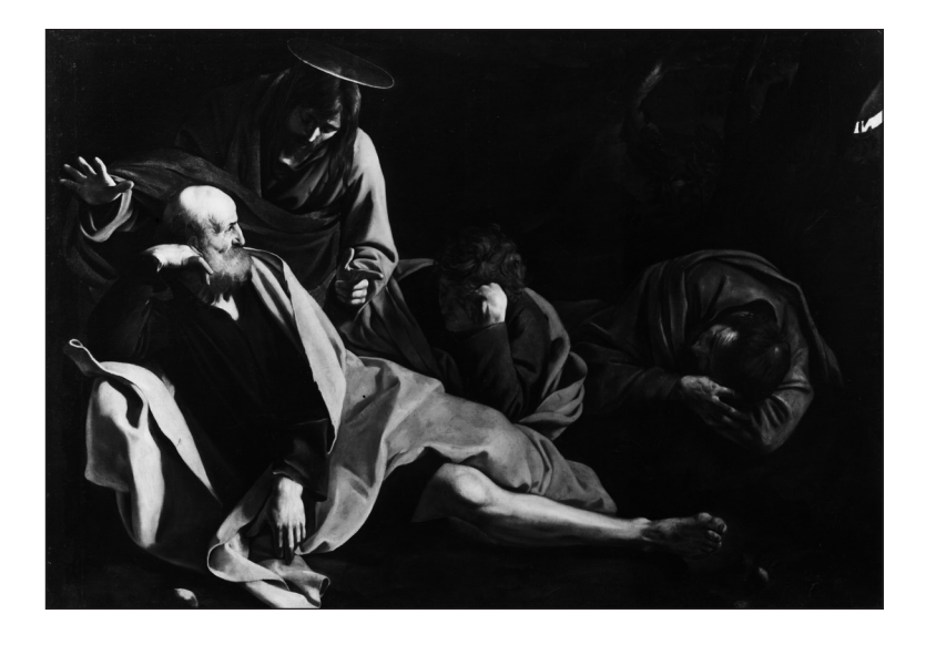
Fig. 7. Caravaggio, Christ on the Mount of Olives, c.1604–05, oil on canvas. Formerly Kaiser Friedrich Museum, Berlin; destroyed in 1945.

Rigorous first-hand examination of the Foundling Shepherd reveals that it has many characteristics in common with Salini's style and recommends that the work can be attributed to him. Although the Caravaggesque quality is part of the work's appeal, it has some details that designate the attribution to Salini. The shepherd's pose is clearly similar to St Peter's in Caravaggio's destroyed Christ on the Mount of Olives (c.1604–05; formerly Kaiser Friedrich Museum, Berlin) [Fig. 7], which I have identified as being influenced, in turn, by Michelangelo's (1475–1564) fresco depicting the Drunkenness of Noah (1509; Sistine Chapel, Vatican City, Rome).<sup>25</sup> The Foundling protagonist has even more of an affinity with the Michelangelo than the Caravaggio, due to the way in which the boy, like Noah, raises and bends his left leg, and leans forward to arch his back. Even subtle details, such as the angle