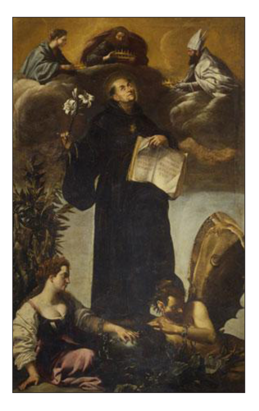
Fig. 4. Tommaso Salini, St Nicholas of Tolentino: With the World, Devil and Flesh Under his Feet, c.1615–16, oil on canvas. Chiesa di Sant'Agostino, Rome.

Numerous scholars have ascribed the Forlì picture to Salini primarily on the basis of the aforementioned flask motif.<sup>20</sup> The comparable battered flasks, however, are distinctly separate objects, as the size and shades of the wicker superbly contrast with one another. The flask in the Forlì painting is the palest of the three examples as its palette ranges from oatmeal to cream. The oils in the Boston and Thyssen pictures are alike in their shades of dark brown, but the Boston flask lacks the golden highlighting of the Thyssen.Yet, all the flasks are comparable because the plaiting runs down the edges to bind the straw in the same way. While the Boston Poppies are in a flask without a handle, unlike the others, the wickerwork features exactly the same type of "handwriting," to quote Giovanni Morelli (1816–1891) in his innovative approach to solving problems of attribution.<sup>21</sup> Morelli, a medical doctor by training, inspected minute details in works of art in a pathological manner in the hope that they would reveal authorship. The Forlì Flowers shows an expansive palette of Mannerist colours that range from