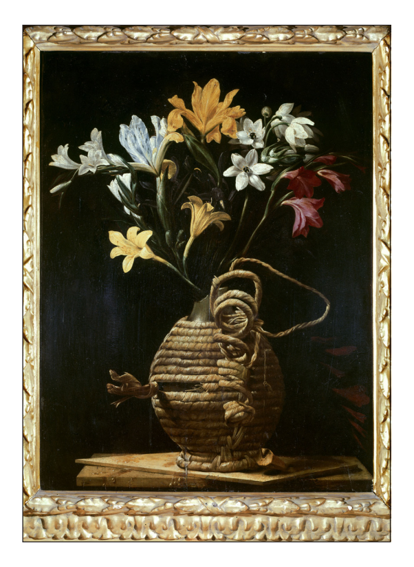
Fig. 5. Attributed to Tommaso Salini, Flowers in a Flask , c.1610–20, oil on canvas. Pinacoteca Civica, Forlì, © Photo SCALA, Florence.

The compositions of all these canvases are similar in the way that the plaiting of the flasks folds across the straw at the base. However, the Young Peasant and the Forlì Flowers have a distinctly Caravaggesque loose coil of wickerwork that spirals from the top and overflows into the viewer's space. The use of shadow over part of the flasks is a strong suggestion that they were painted by the same artist's hand. The Thyssen and Forlì flasks are moderately submerged in shadow, as are the furthest leaves in the Boston Poppies ; the subtle technique enhances the three dimensional effect. Moreover, the foliage round the left of the vase in the Boston Poppies mirrors the pattern of the Young Peasant 's hair that falls into shadow at