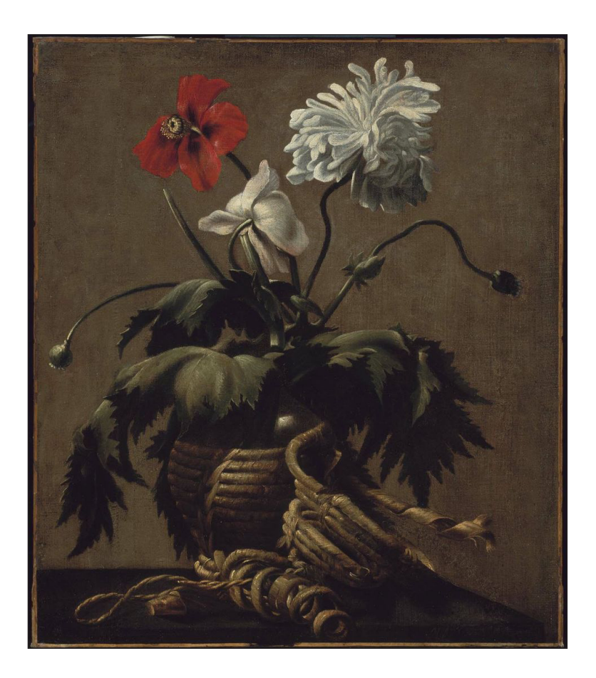
Fig. 1. Attributed by the author to Tommaso Salini, Still Life with Poppies, c.1610–20, oil on canvas.