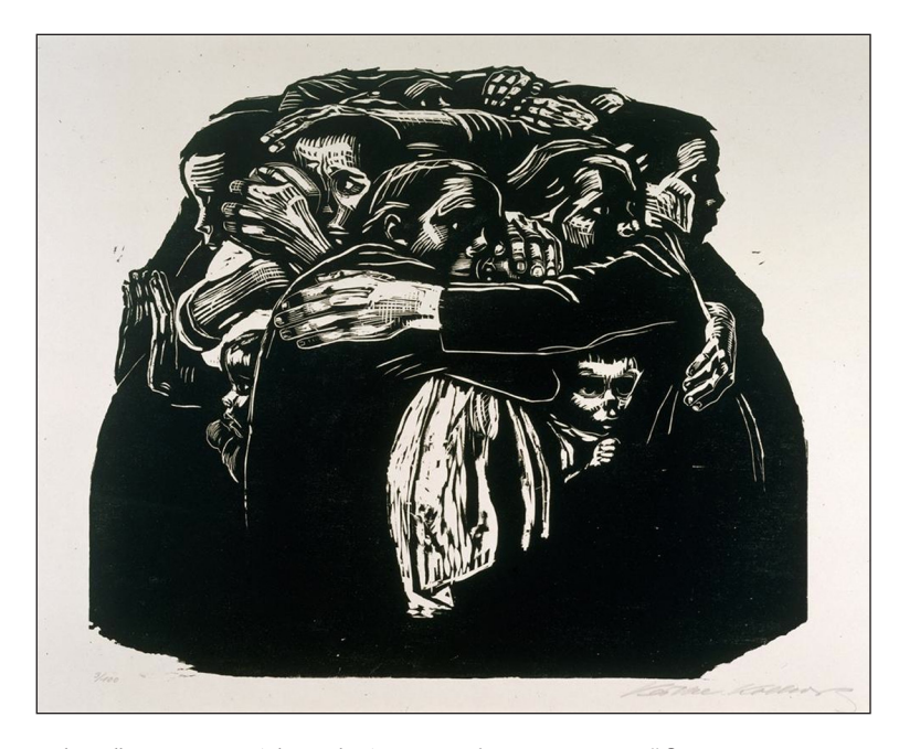
Fig. 6. Käthe Kollwitz, Die Mütter (The Mothers), 1923, woodcut, 13 1/2 x 15 3/4" © DACS 2014.

The years following World War I brought much reason for protest. Hunger and