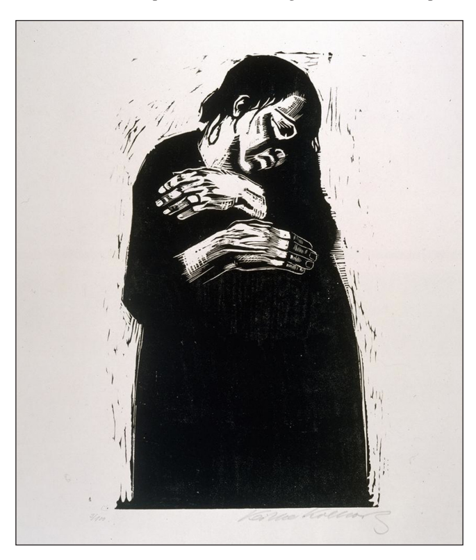
Fig. 4. Käthe Kollwitz, Die Witwe, I (The Widow, I), 1923, woodcut, 14 7/8 x 9 5/8"

Kollwitz fought against the machine, both in her theory and her actions. If the human being was transformed into a cyborg built for war, then Kollwitz tried to regain that humanity which was lost along the front lines and home fronts by recalling the purely human emotions of compassion, fear, wanting, loneliness, and despair. She worked