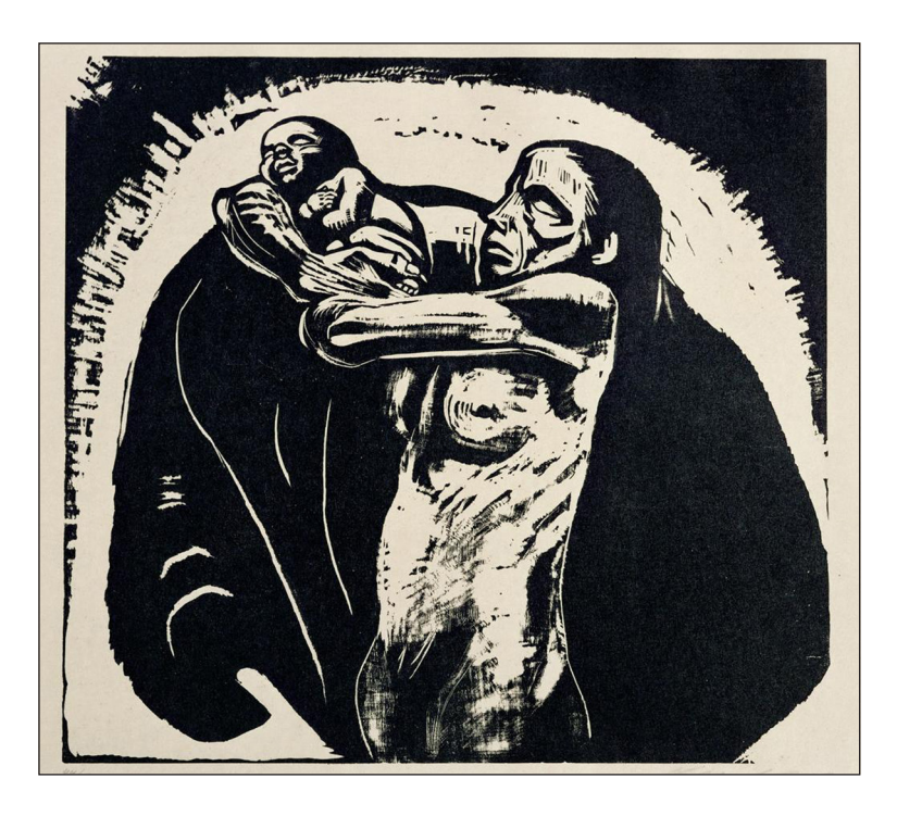
Fig. 1. Käthe Kollwitz, Das Opfer (The Sacrifice), 1923, woodcut, 14 5/8 x 16 1/16".

Kollwitz addresses this notion of motherhood through her first image of the series, Das Opfer [Fig. 1]. Compositionally, this image presents an emaciated woman gingerly offering up her slumbering baby to the world. Alternating pools of darkness and light surround both mother and child. Both are naked, yet the mother's bony arms, which awkwardly crane the child to meet the unknown, conceal the baby's gender. The woman reveals all of herself for inspection. Her womb and breasts are given a type of worn value: these are the necessary tools of her trade, in constant service of others. She evokes the image of a machine that works only to produce the next generation of Germans, exemplified by her robotic gesture and tightly shut eyes. It is important that Kollwitz chose to depict a woman as the one sacrificing and being sacrificed: this dramatic performance is heavily encoded within the particular modes of gender power. Early-twentieth century German, masculine dominance