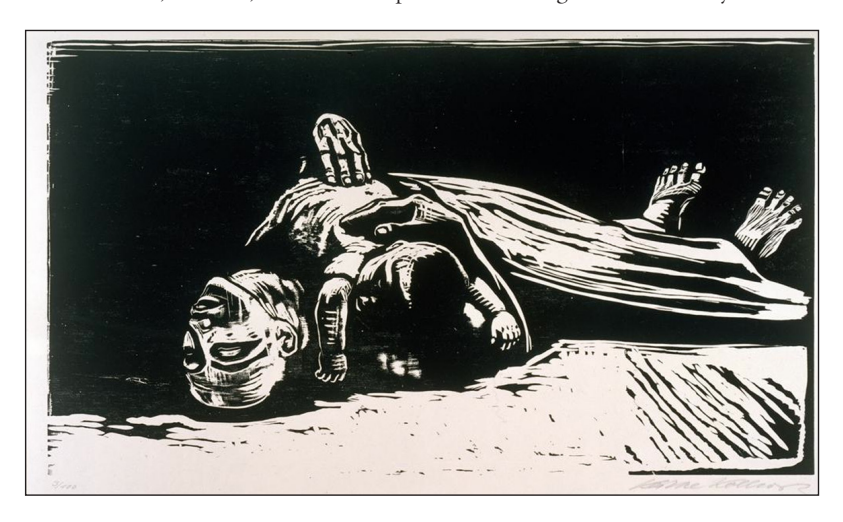
Fig. 5. Käthe Kollwitz, Die Witwe, II (The Widow, II), 1923, woodcut, 11 13/16 x 20 7/8"

Continuing with this theme, Kollwitz created two depictions of war widows, Die Witwe, I and Die Witwe, II [Figs. 4–5]. Die Witwe, I represents a woman who is cradling herself, her head resting on her right shoulder and her eyes tightly shut. She is reminiscent of the baby offered up to the state in Das Opfer . She is alone, left with no one and nothing to comfort her. She appears to be the only one left of her family. Die Witwe, II is similarly rendered. Unlike the former widow, however, this woman is presented cradling a slackened baby on her chest.