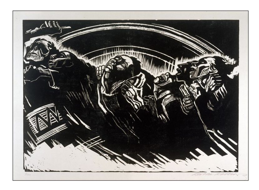
Fig. 2. Käthe Kollwitz, Die Freiwilligen (The Volunteers), 1923, woodcut, 13 3/4 x 19 1/2" © DACS 2014.