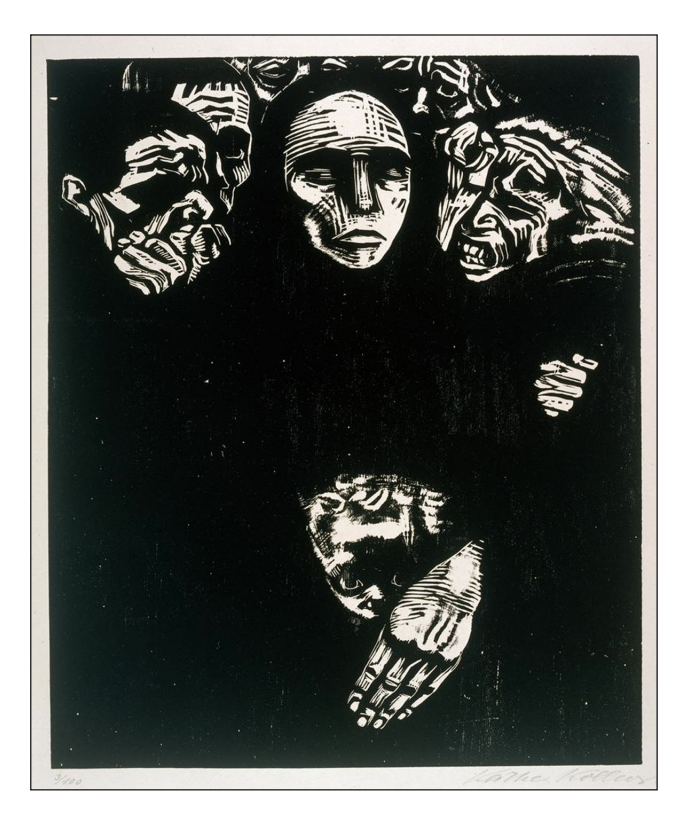
Fig. 7. Käthe Kollwitz, Das Volk (The People), 1923, woodcut, 14 3/16 x 11 13/16" © DACS 2014.

malnutrition ravaged millions of Germans. To meet emergencies, the government began to overprint money. Inflation increased, finally wiping out all savings and many investments. By the end of 1918, the German mark had lost about three-quarters of its 1913 value.<sup>28</sup> As prices rose, the costs of housing, fuel and food outstripped wage increases and unrest spread, particularly in urban areas. Additionally, the new Weimar Republic struggled to support the millions of war widows, orphaned children, and men who could no longer work because of their injuries.<sup>29</sup> As both the public and private notions of the family had now faltered, Kollwitz utilised Der Krieg to propose different models of how people at home could once more become meaningful agents in their own lives. For example, in the last two blocks of the series, she created stoic images of the people left to survive in post-war Germany. Together the figures in Die Mütter and Das Volk became the community, the means for Germany's salvation and future. These are not malleable tools of industry, but mortal characters capable of feeling and understanding. If the family unit is gone, then all that is left is a feeling of solidarity in which the community takes care of one other. This understanding contrasts with the