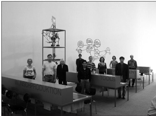
Fig. 6. The Park Fiction Group at the documenta XI in Kassel, 2002.

In order to prevent large-scale social upheaval and assure voter favourability, the city finally made special allowances available to residents in St. Pauli in August 1997. In the former hospital's buildings, an acute day ward, community health centre, and home for the elderly were to be established. 19 The park, too, was approved for planning with funds from