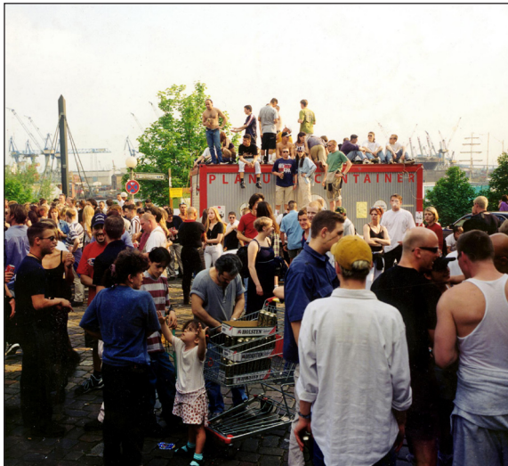
Fig. 4. Park Fiction, Hamburg, activities anticipating the park (rave around the planning container), 1998.

Quentin Tarantino's film Pulp Fiction inspired the name Park Fiction as a working title for the project, and it was retained for the final realisation of the park. 11 At first, the proposal for an artless ecological meadow was raised, influenced by the natural garden movement of the 1980s. Then, in the summer of 1995, the artists Christoph Schäfer and Cathy Skene joined the urban action group. 12 Skene and Schäfer worked together from 1988 to 1996, and before the Park Fiction project they had begun to establish themselves as artists with participatory projects that critically examined urban life. Skene and Schäfer persuaded other activists that a simple, green field was too esoteric and not representative enough for the needs and wishes of the district's residents. The two artists developed a democratic planning process for the park with the other members of the group, encouraging intense and creative public participation, in contrast to the standard urban planning process which involved little public engagement. Schäfer and Skene were inspired by Situationism, including Henri Lefebvre's writings on