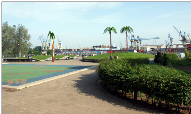
Fig. 2. Park Fiction, 1994-2005, Hamburg, volleyball court, Flying Carpet (grass field in a wave form), isle with artificial steel palms, dog garden.

In comparison with common forms of protest such as demonstrations and leaflets, the creation of park has been used as an alternative form of activism. Particularly famous is the People's Park in Berkeley, California, which was established through the hard-fought efforts