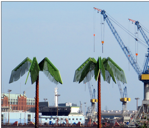
Fig. 3. Park Fiction, 1994-2005, Hamburg, artificial steel palms.

The proposal for a park by the Hafenrandverein was decidedly pacifist and did not initially involve squatting, yet the possibility of an occupation or protest always had the potential to be a powerful factor due to the radical histories of numerous association members. The collaboration with the St. Pauli Church, the St. Pauli school, and especially the nearby GWA neighbourhood centre proved advantageous because they offered the use of rooms for meetings and events, office supplies, and professional skills in areas such as social work and print media. They also provided an existing network of residents and institutions in an area with a tradition of political resistance. An additional advantage was provided with the network of musicians, artists, and visitors surrounding the Golden Pudel Club , whose premises the city senate wanted to demolish to make way for the new high-rise. 9 Among the founding members of the Golden Pudel Club was Rocko Schamoni, a political punk and leftist pop musician who toured with the band Goldene Zitronen . The Golden Pudel Club was a meeting place for other musicians with a political and socio-critical attitude who were called the Hamburg School, in reference to the Frankfurt School of